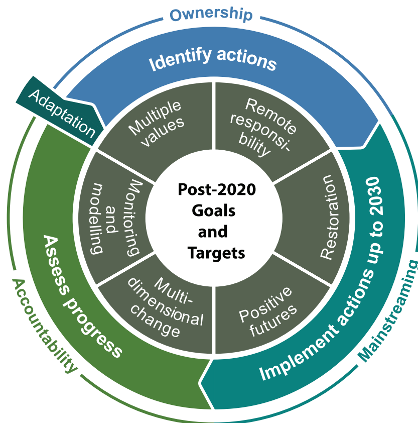
FIGURE 1 Scientific advances of the past 10 years inform a framework for implementation of the post-2020 goals and targets. The framework promotes ownership and mainstreaming, accountability and monitoring of biodiversity and is applicable across sectors and spatial scales

Although the proposed Target 21 (Table 1) recognizes the importance of equitable participation of local communities in decision-making, we argue that recognizing and fostering these different values systems needs to underpin the translation and implementation of the entire post-2020 set of goals and targets. This would increase acceptance, own-