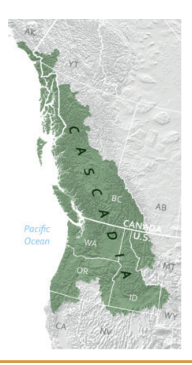
Projection: US National Atlas Equal Area Sources: Commission for Environmental Cooperation, Natural Earth, QGIS <a href="https://en.wikipedia.org/wiki/Cascadia_(bioregion)">https://en.wikipedia.org/wiki/Cascadia_(bioregion)</a> Laura Tierney, author (CCBY-SA 4.0)