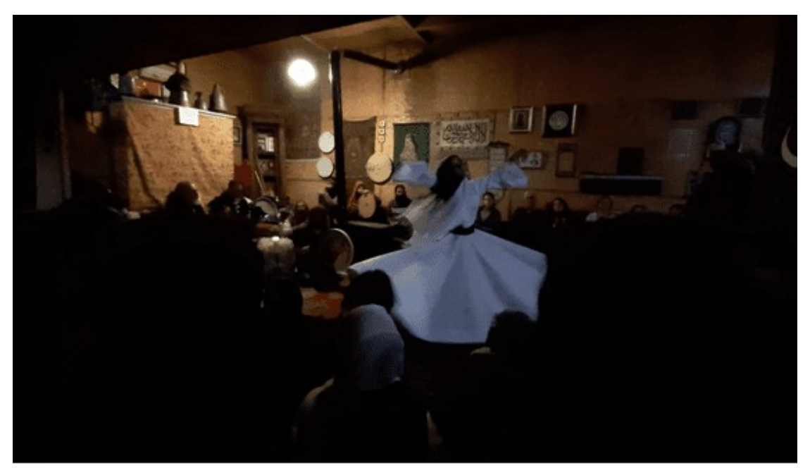
Figure 4 A Lodge Gathering during the Love Pilgrimage

operating as dervish lodges. While most of the Sufi dervish lodges have been spatially organized to accord gender-segregation, during the love-pilgrimage, the lodges host female and queer participants who do not belong to any order and do not conform with gender-segregation. Talks on spiritual love, the life of Mevlana and his teachings are presented both by male and female dervishes and are usually followed by ecstatic rituals of zikir and sema .