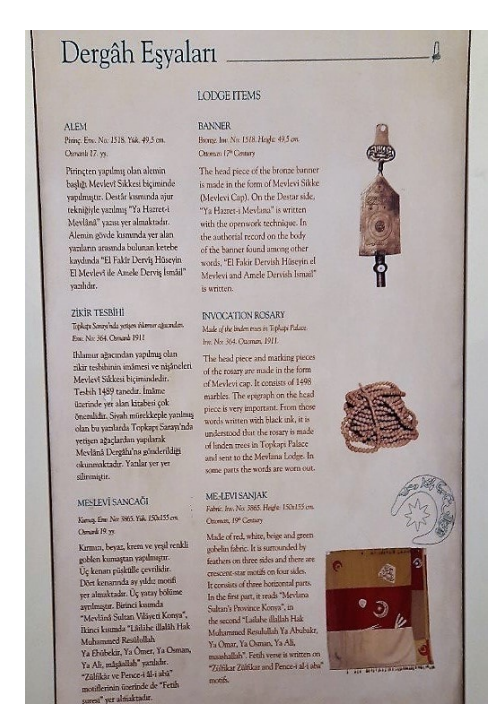
Figure 2: Depictions of Mevlevi Lodge Items in the Mevlana Museum, photo by the author.

The history of culturalization of Mevlana's tomb is as old as the history of the Turkish Republic. Considered the traces of imperial legacies, sacred sites such as tombs of saints, dervish lodges and sites for traditional healing were closed down in 1925, soon after the establishment of the Turkish republic. In 1926, as a part of the policies of closing down religious orders ( tarikat ), the dervish lodge that was hosting Mevlana's tomb was transformed into the Museum of Asar-1 Atika, 'the ancient monuments'.