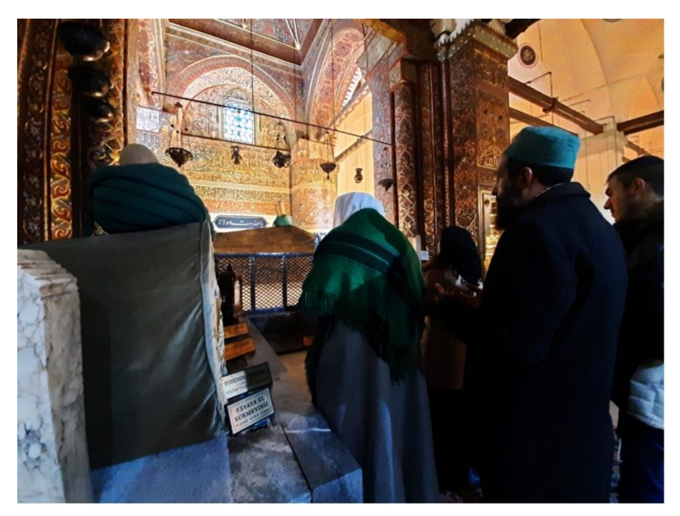
Figure 1 The Musealized Tomb of Mevlana

dervish lodge. I spend most of my time in lodges where rituals were held and in the Mevlana Museum where pilgrims become aligned with Mevlana's love.