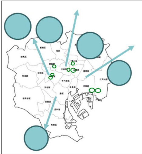
Figure 1. Ethnic towns (in green circles) and the main border hubs of Filipino migrants from below.

during their student visa status, and more importantly also either to the location of the company housing when once employed or to where co-ethnics reside. The companies cooperating with recruitment agencies decide primarily on the residential location and through that also the geographical extent of the everyday socio-spatial practices of these migrants. As one of the Filipino migrants explained: