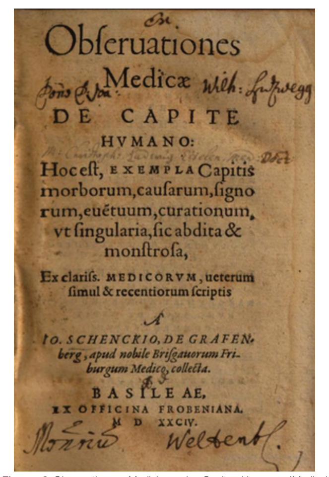
Figure 2 Observationes Medicinæ de Capite Humano (Medical Observations on the Human Head, Basel, 1584), Johannes Schenck von Grafenberg (1530–1598), Wikimedia Commons, Public Domain

Chinese Medicine and Culture | Volume 5 | Issue 1 | March 2022