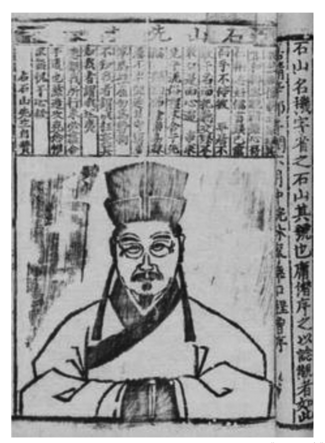
Figure 1 Image from the 1531 edition of Shi Shan Yi An (《石山医案》 Medical Cases of Shi Shan ) in the rare book library of the China Academy of Chinese Medical Sciences

Chinese Medicine and Culture | Volume 5 | Issue 1 | March 2022