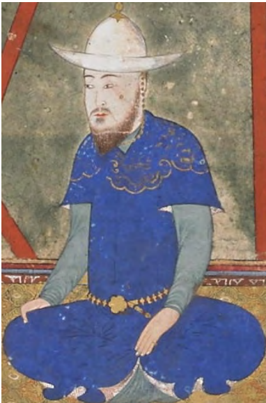
Extract: Ulugh Beg