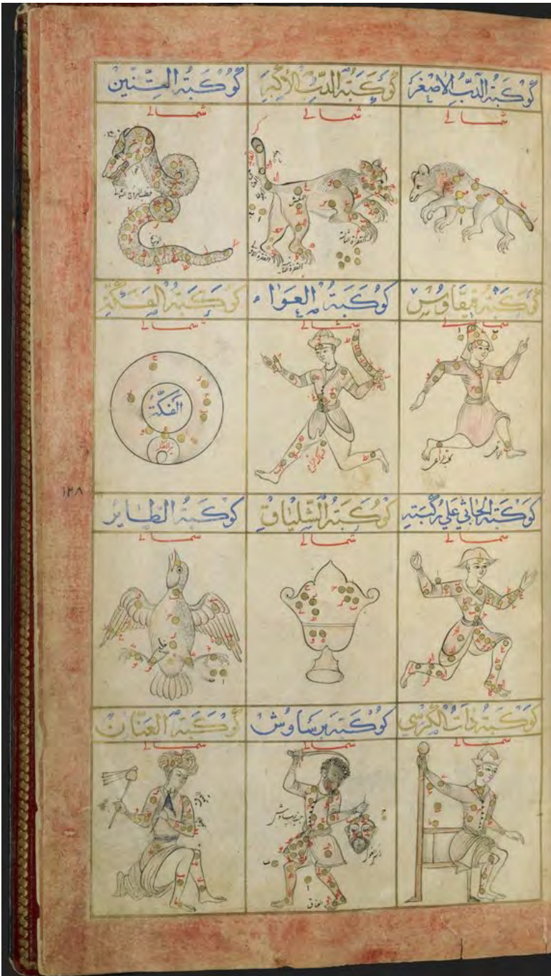
Plate 13. Table of stellar constellations

Harvard Art Museums/Arthur M. Sackler Museum, Gift of Philip Hofer, MS 1984.463, f. 132a. Photo © President and Fellows of Harvard College.