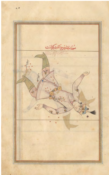
Plate 9. Cepheus

MS New York, NYPL, Spencer Persian 6, fol. 27a. By permission, NYPL, New York.