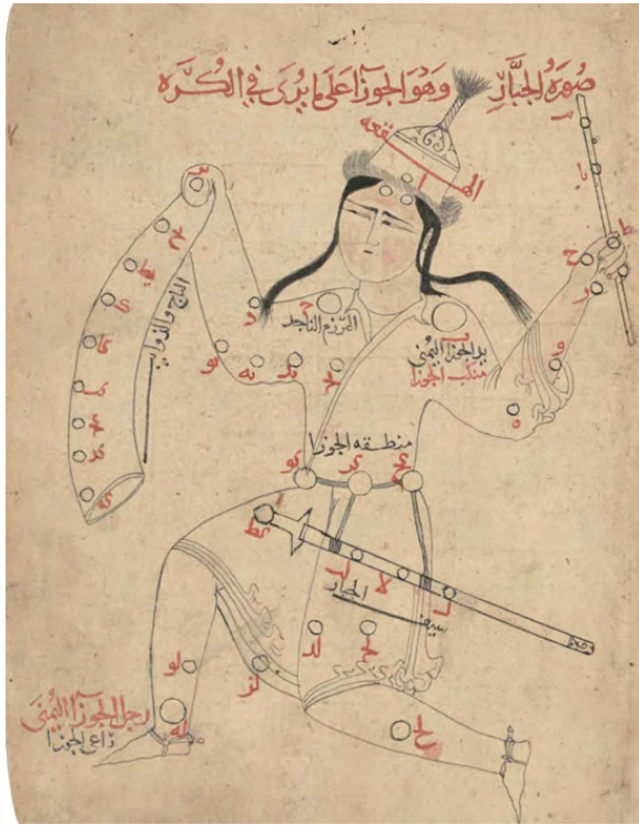
Plate 5. Orion as shown on the globe

MS Doha, MIA, 2.1998, fol. 126a.