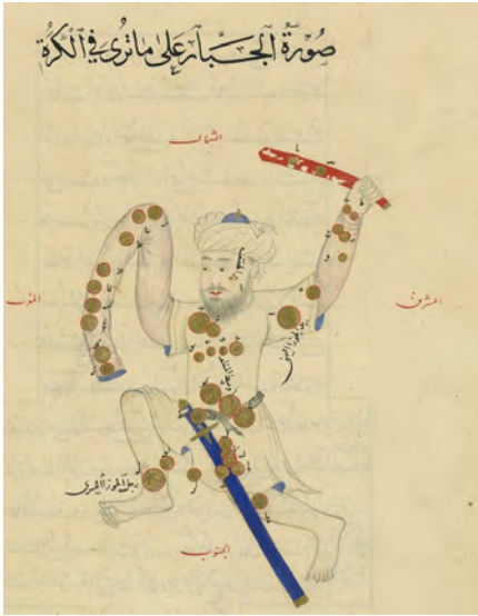
Plate 7. Orion