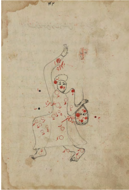
Plate 2. Perseus with the head of a demon ( ghul )

MS Doha, MIA, 2.1998, fol. 42b.