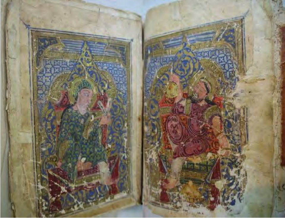
Plate 1. Double frontispiece, possibly showing on the left 'Abd al-Rahmān ibn 'Umar al-Ṣūfī and on the right his son Ḥusayn

From Ibn al-Ṣūfī's Poem on the Stars ( Urūjza fī-l-kawākib ), dated 554/1159–1160. MS Tehran, Reza Abbasi Museum, M 570, fols 1b–2a.