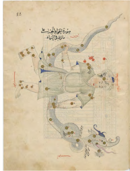
Plate 8. Serpentarius with a smiling Serpens