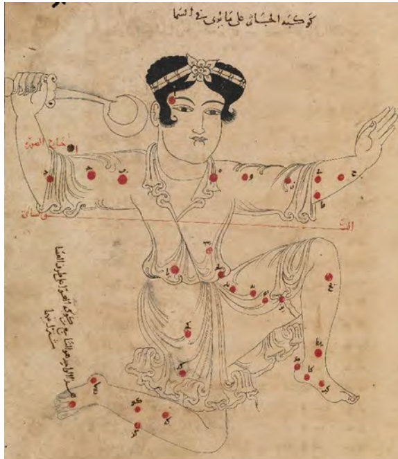
Plate 6. Hercules

MS Oxford, Bodleian Library, Marsh 144, 82.