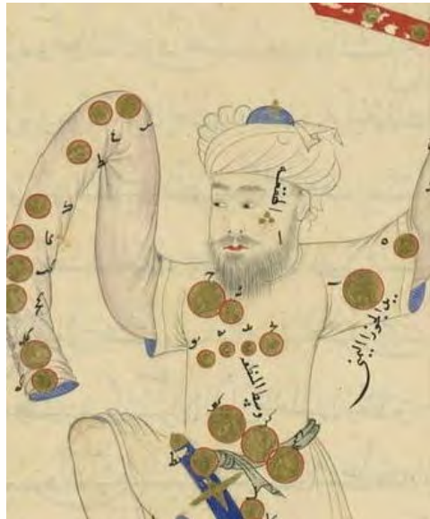
Extract: Orion [see Plate 7]