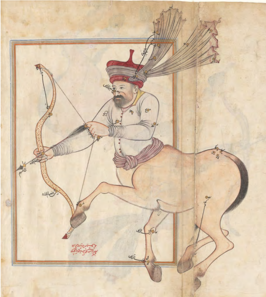
Plate 12. Manūchihr Khan as Sagittarius

MS New York, NYPL, Spences Persian 6, fol. 121a.