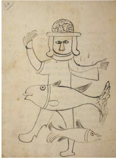
Plate 3. Andromeda with the fishes

MS Berlin, Preußischer Kulturbesitz, Staatsbibliothek, Springer 1855, fol. 20a.