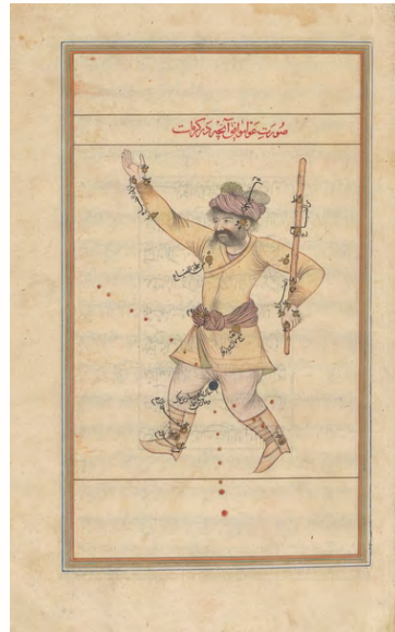
Plate 10. Boötes

MS New York, NYPL, Spencer Persian 6, fol. 27a. By permission, NYPL, New York.