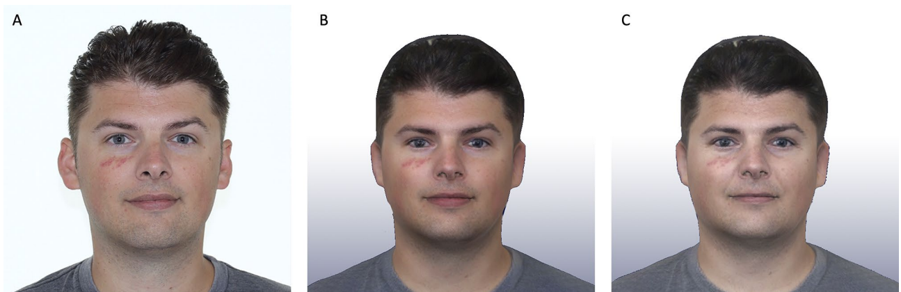
Figure 2. Avatar creation process. (A) Source image; (B) digital avatar version reflecting present self; (C) aged avatar version reflecting Future Self. Informed consent was obtained from the participant for publishing their image.

Future time perspective. To explore participants' perception of their future prospects, the 10-item Future Time Perspective scale (FTP) 39 was employed. FTP measures perceptions about what is possible in one's remaining lifetime and the awareness of constraints and barriers of one's future time using 7-point Likert scales ( completely disagree to completely agree ). Alpha reliability was acceptable for all three measurement points (T1, T2 and T3) ( \alpha \geq 0.75 ).