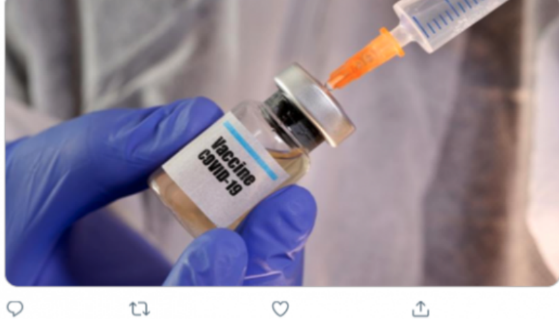
Figure 2. Strong tie—No bandwagon condition (SN).