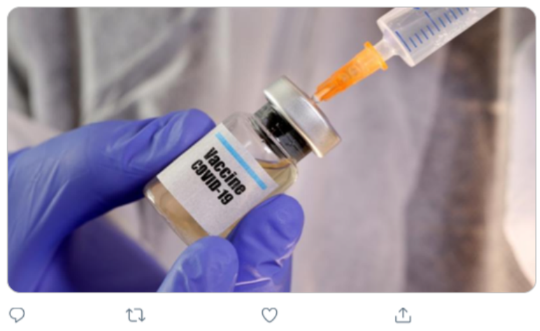
Figure 4. Celebrity—No bandwagon condition (CN).