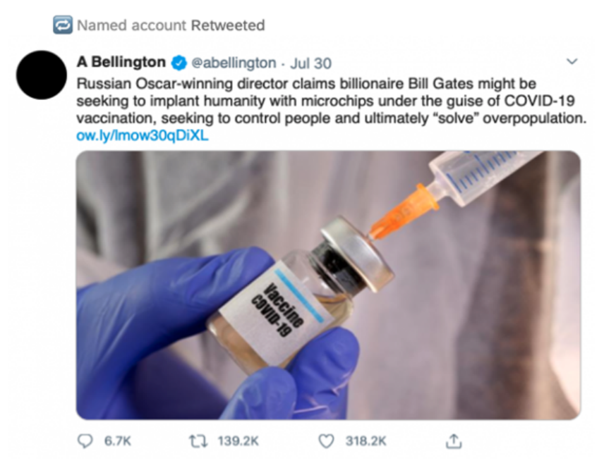
Figure 1. Strong tie—Bandwagon condition (SB).