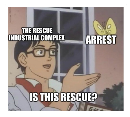
Fig. 5. A sex worker meme about the rescue industry's misunderstanding of sex work. It shows that while some members of the rescue industry may believe that arrest can help "rescue" sex workers, sex workers know it to not be the case.