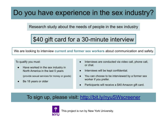
Fig. 3. Flyer distributed on social media to recruit sex industry workers. Portions are greyed out for anonymity.

4.3.2 Interview protocol. We began the interviews by emphasizing that interviewees did not need to answer any question or describe any negative experience that they did not want to. Then, we asked about the participant's background, including the type of sex work they did and why they started doing sex work. If appropriate (i.e., for those who were not trafficked), we also inquired about how participants found, scheduled, and communicated with clients, to understand how organizations' modes of outreach aligned with workers' existing means of communication. We then queried participants' experiences and sentiments regarding being reached out to by organizations and any recommendations they had for how the outreach could have been improved. We then