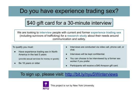
Fig. 2. Flyer distributed to organizations to recruit sex industry workers in contact with them. Portions are greyed out for anonymity.

4.3.1 Recruitment. Workers in the sex industry were recruited by sending the flyer in Figure 2 to organizations including TechnologyOrganization's contacts, participants in the organizational interviews, and other rescue or sex-worker-led organizations to distribute, and by posting the flyer in Figure 3 to social media. The flyer posted to social media was publicly viewable (without any platform-specific targeting strategies to find sex industry workers) and tailored so as to avoid an emphasis on trafficking, since it might have otherwise been ignored by sex industry workers. However, some survivors of trafficking who are still in contact with service organizations do not identify as sex workers, so we used the flyer that recruited "people with current and former experience trading sex" to match the vocabulary of this community.