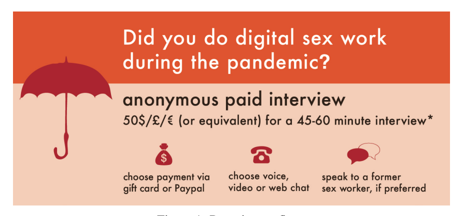
Figure 1: Recruitment flyer.

Digitally mediated in-person workers were often also ineligible for healthcare, and could not social distance (e.g., ride-share drivers) [Rani and Dhir(2020)]. Ravanelle et al. and Stephany et al. both found that, as with sex workers, there was a growth in workers entering the digitally-mediated gig workplace due to the pandemic and because of the "distancing" effect - i.e., more goods and services being distributed via digital mediation - that there was the possibility of increased income during this time [Polkowska(2021), Stephany et al.(2020)].