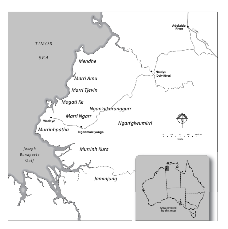
FIGURE 1. Murrinhpatha and surrounding languages. Map drawn by Brenda Thornley.