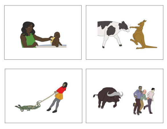
FIGURE 2. Example stimuli pictures depicting the different event combinations.

2.2. MATERIALS. Forty-eight images depicting transitive events served as test pictures (see Figure 2). The test pictures fully crossed thematic role (agent, patient) with humanness (human, nonhuman), such that twelve pictures had a human agent and a human patient (e.g. 'girl pushes boy'), twelve had a human agent and a nonhuman patient (e.g. 'man catches fish'), twelve had a nonhuman agent and a human patient (e.g. 'crocodile chases children'), and twelve had a nonhuman agent and a nonhuman patient (e.g. 'kangaroo boxes cow'). All images in the materials depicted concepts known to Murrinhpatha speakers and could be described using either existing words in the language or Murrinhpatha borrowings from English (e.g. pigipigi 'pig/wild boar'). Twenty-nine of the images were used in Norcliffe, Konopka, et al. 2015; a further nine-teen were constructed anew (all test pictures are accessible from the project's Open Science Framework (OSF) page: https://osf.io/2j3nu/). An additional ninety-six pictures served as fillers, which mostly depicted one-argument events (e.g. 'boy swimming', 'frog jumping').