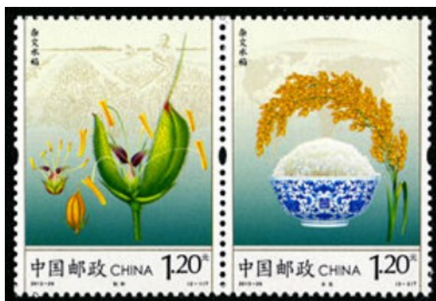
Caption: 2013 Hybrid rice stamp

Beyond the domestic context, it will be important to watch what the heterogeneous reverberations of seed politics from China entails. Already, China's party-state and other domestic actors are engaged in agricultural and food system issues beyond national borders. Chinese actors are providing agricultural extension services in other countries and participate in academic and policy debates on global food systems. They have become entangled in conflicts across borders around seed IP, but have also been subjected to unwarranted paranoia about 'seeds from China'. With the acquisition of Syngenta by ChemChina, Chinese companies participate actively in the consolidating trend on the global seed market, and initiatives taken by the FAO while headed by China shape global agricultural politics more broadly. In times of large socio-ecological transformation, agrobiodiversity loss and climate change, the agricultural paths advanced by China's party-state, but also other domestic actors, will be shaping factors for global food systems.