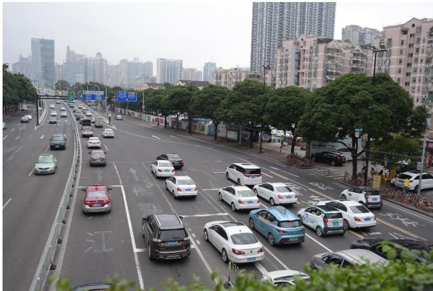
Figure 5: Notice the shared bicycles near the bus stations. However, there are no cycle lanes in this street.