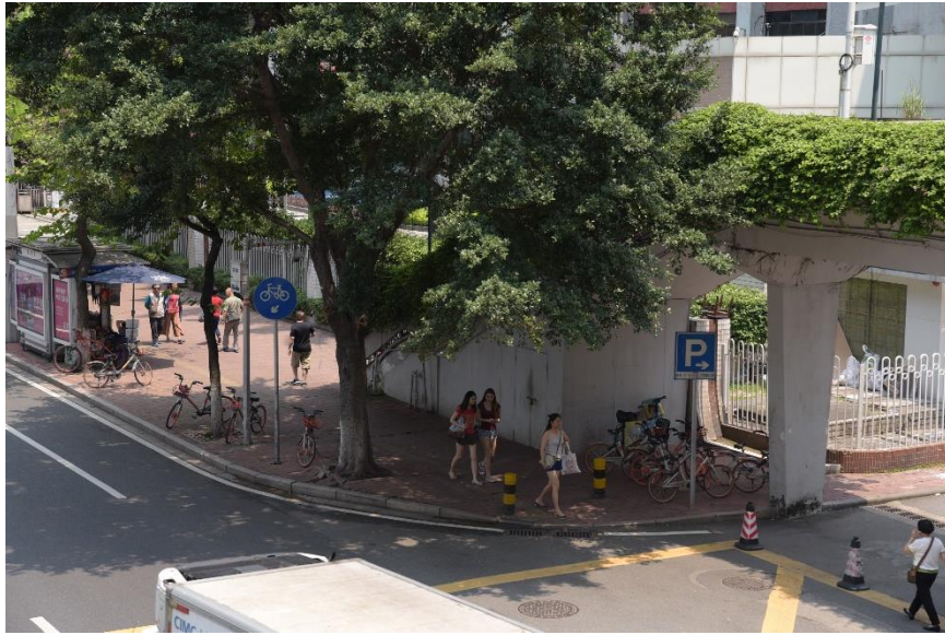
Figure 3: Newly drawn cycle lane (1-meter in width, suggested by the blue sign), Guangzhou, 2019. This is the same road as in Figure 1.