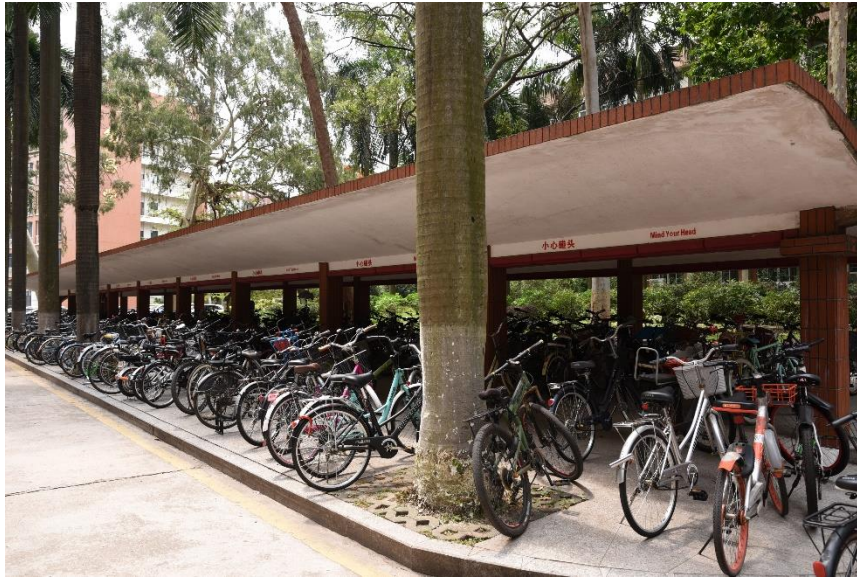
Figure 2: Old-style bicycle shed.