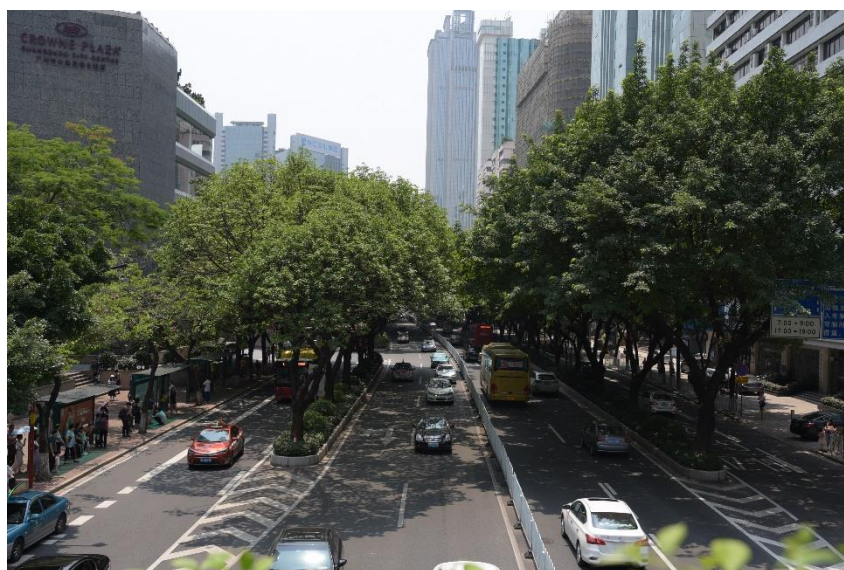
Figure 1: Old cycle lanes (two car-lane in width on each direction), which are now car lanes, separated by trees, Guangzhou, 2019.

on how exclusive the space was reserved for bicycles. 6 While Osnos's mapping of the cycling space reflects the invasion of cars in the twenty-first century, his taxonomy still bears an imprint from the previous era. Along the major arteries, cycle lanes were often wide enough for auto traffic. They ran parallel to—but were separated by trees from—the roads, which were mostly two-to-four lanes wide (figure 1). In the narrower streets, there may not have been a physical marker separating the cycle from the auto lanes, but there was an informal understanding that cyclists took the right and drivers the centre of the road. While conflicts between cyclists and drivers did exist, there was little competition between the two. Given the number of cycles on the streets, especially during rush hour, cycle traffic jams were not uncommon.