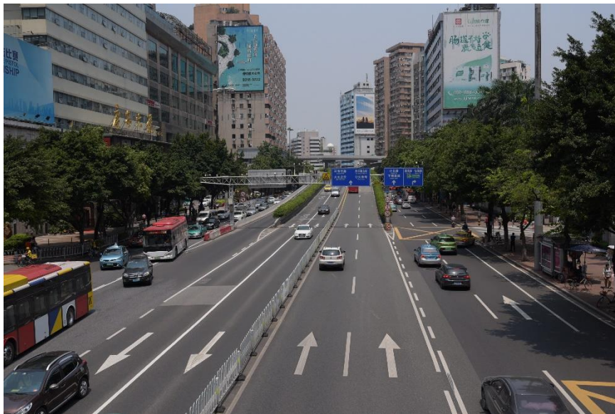
Figure 4: Cycle lanes (signaled by the wide line next to the curb) are often used by cars when passengers need to get on or off.