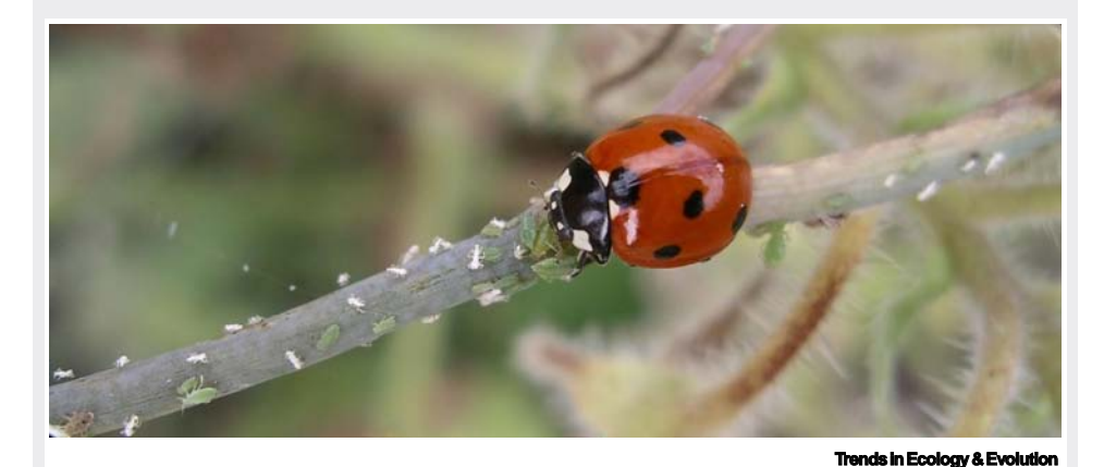
Figure I. Using automated identification technology to monitor insects can be a win-win situation for citizens and scientists. Using such tools, citizens can learn about species identity and ecology, and scientists can use the data collected to study, for example, species interactions, such as this lady beetle (Coccinella septempunctata) feeding on aphids on their host plant.

New technologies have the potential to increase the accessibility and diversity of entomological citizen science. For instance, citizen science activities could be extended to volunteers with expertise in joint software development and data visualisation. Care, however, needs to be taken to avoid access barriers and unintended exclusion due to possible technology barriers or a disconnect of data, people, and wildlife. Overall, there could be considerable benefits from involving citizen scientists in the development and application of the tools through cocreated projects and community partnerships [103].