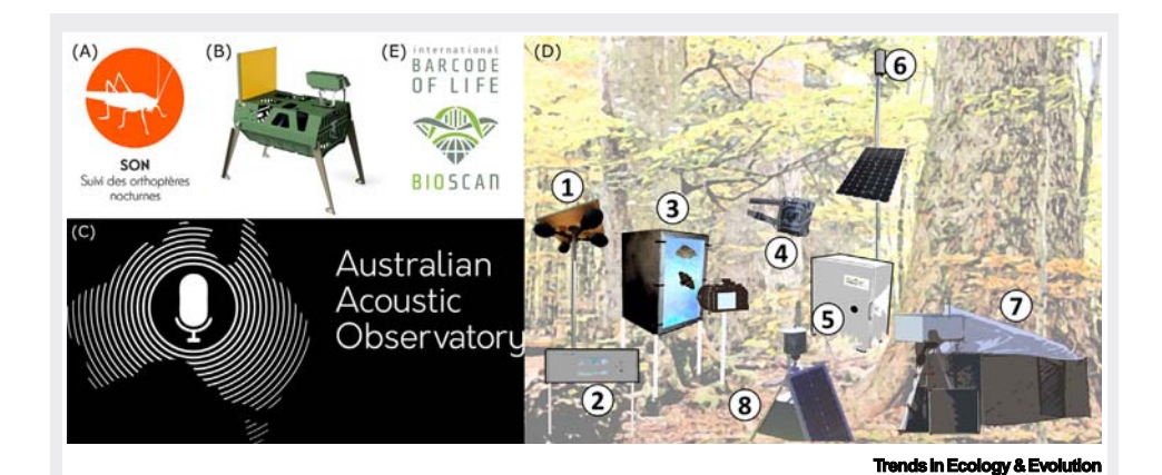
Figure I. (A) Suivi des Orthoptères Nocturnes, the French nation-wide monitoring scheme for bush crickets. (B) The DIOPSIS (digital identification of photographically sampled insect species) automatic insect monitoring device. (C) The Australian Acoustic Observatory used automatic acoustic sensors to record all environmental sounds. (D) The BIOSCAN project of the International Barcode of Life consortium aims to collect DNA barcodes of 10 million insect specimens and characterise their parasitic, mutualistic, and symbiotic relationships at over 2000 locations worldwide. (E) Illustration of the modular AMMOD (automated multisensor stations for monitoring of species diversity) monitoring station design. (1) Acoustic monitoring. (2) Smellscapes (plant volatile organic compounds). (3) Visual monitoring: Moth scanner, (4) Visual monitoring: Wildlife camera trap, (5) Base station, (6) Data transfer and management, (7) Metabarcoding: Automated Malaise trap, (8) Metabarcoding: Automated pollen sampler. Figure draft and design: J. Wolfgang Wägele.

to detecting flying insects, and taxonomic classification remains limited. Also, monitoring would benefit from improved algorithms for filtering biological targets from other airborne particles, as well as increased knowledge of the reflective properties of insect taxa [54,55].