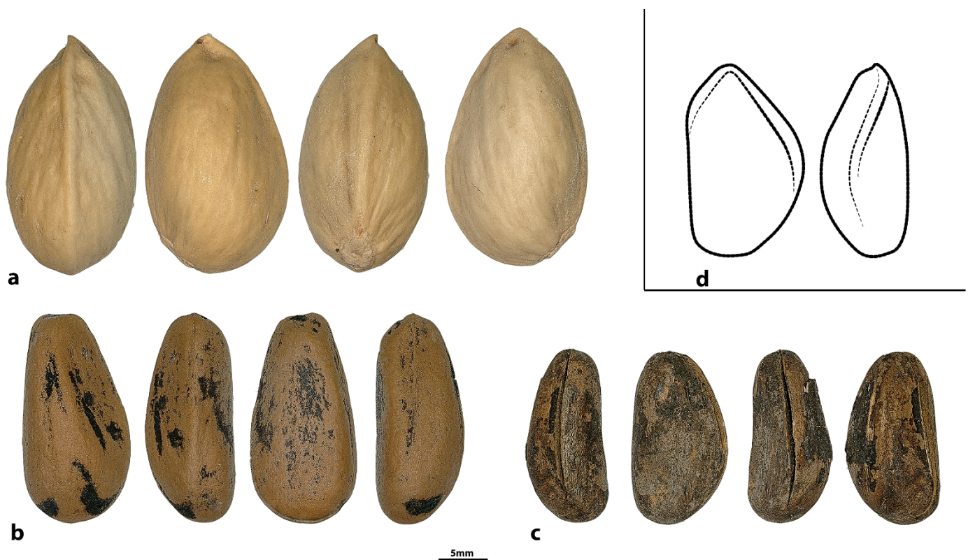
Figure 1. (a)—modern cultivated pistachio nut; (b,c)—modern pine nuts; (d)—figure from Pefkakia-Magoula, Greece (recreated from [95]) formerly identified as true pistachio.