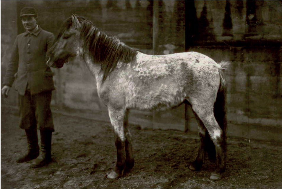
Figure 2: Stallion "Tref" with winter coat (March 1939). From P.III-47/6/191, PBA/PAN. Reproduced with permission.

continued his project of recreating the authentic German wildlife mentioned in the national epic poem, the Nibelungenlied . Apart from this literary inspiration, the Heck brothers also drew from their father's breeding praxis that he had developed at the zoo through his attempts to recreate the ancestor of wild goats by crossing ibex with domestic goats. 52 Interpreting this experiment as a successful "reawakening" of common wild traits by back-breeding, they employed a similar method to resurrect the legendary wild horse: