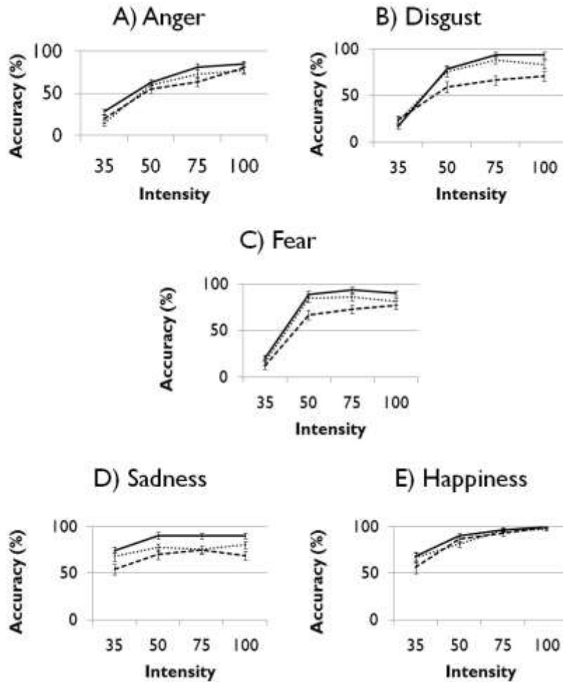
Figure 3. Percentage of correct answers (accuracy) for each emotion depicted as a function of display intensity. Bars represent standard error of the mean. Black lines = controls. Dashed lines = right TLE patients. Dotted lines = left TLE patients.

control did not change the results, the three way interaction still the only significant finding. Thus, we conclude that differences in FER are not due to differences in education.