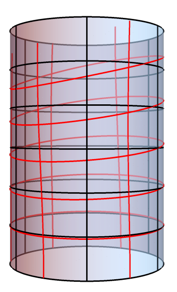
Figure 2: Flat cylinder in which the conformal field theory lives. Black curves correspond to slices of constant time (vertical) and angle (horizontal) associated with the w, \bar{w} coordinates. The red curves represent constant time and angle associated with the z, \bar{z} coordinates with the now infinitesimal diffeomorphism (22-23) specified by f(t,z) = z + \varepsilon(3t^2 - 2t^3)\sin(z) + \mathcal{O}(\varepsilon^2) with \varepsilon = 0.2 (see also (40) for a definition of infinitesimal conformal transformations).

We do not implement any antiholomorphic conformal transformations, therefore the circuit only implements the trivial transformation \bar{z} \to \bar{z} which leads to (23). An example of diffeomorphisms (22-23) and their effect on constant time slices is shown in figure 2. These diffeomorphisms lead to the following energy-momentum tensor expectation values,