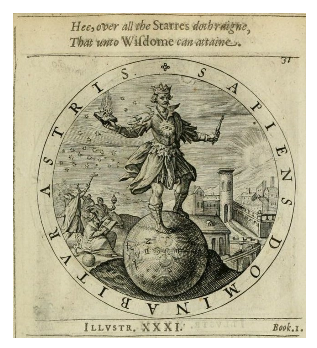
Figure 2. George Wither, A Collection of Emblemes Ancient and Moderne (London, 1635), Book I, Emblem 31. Public Domain.