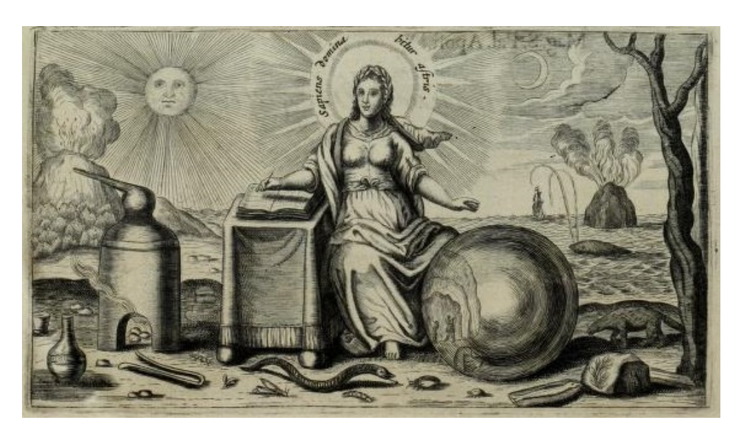
Figure 3. Athanasius Kircher, Mundus Subterraneanus (Amsterdam: Joannem Janssonium and Elizeum Weyerstraten, 1665), close-up of the bottom center section of the frontispiece. Public Domain.

remained, of course, by the early eighteenth century, the rhetorical impact of astrology on such discussions in theological and philosophical spheres had largely subsided.