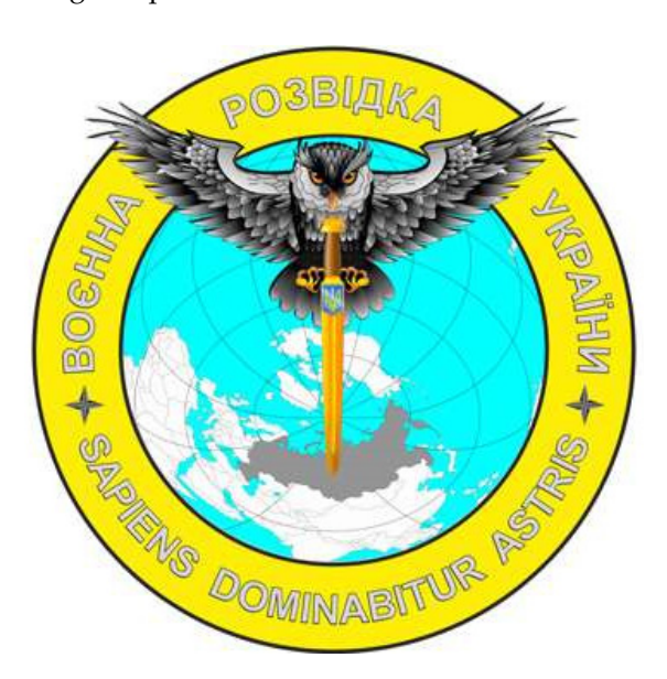
Figure 4. Emblem of the Main Directorate of the Ukrainian Defense Intelligence, 2016. Public Domain.

poets, natural philosophers, and other students of astral knowledge adopted the phrase to stake out a position on the relationships between fate and free will, fortune and agency, determinism and contingency, natural causes and divine intervention, the power of God and the power of the individual, and the influence of the stars and the astrologers' capacity to understand it. These relationships were not dichotomous but dialectical, and it is precisely because they were not dichotomous that astrologers found such utility in the adage "sapiens dominabitur astris."