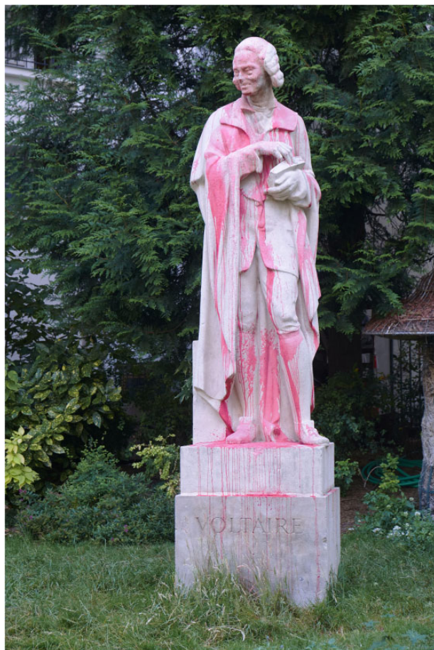
Statue of Voltaire, Saint-Germain-des-Prés, Paris.