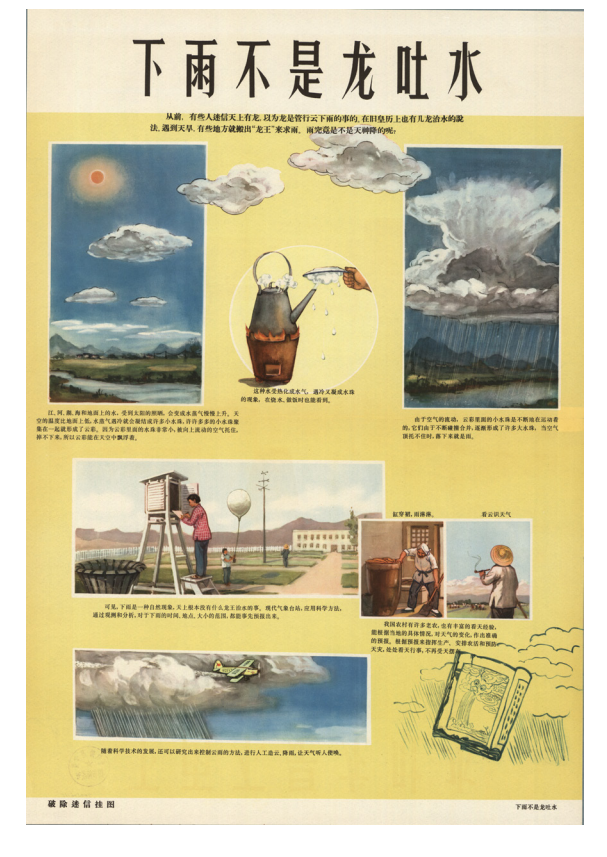
Figure 3: Woman taking measurements from meteorological instruments housed within a Stevenson screen and a person holding a weather balloon close by (centre left); depiction of an old farmer observing the clouds (centre right). "Rain is no dragon spit" (下雨不是龙吐水), Science Popularization Press, December 1965.

Soon after the 3rd National Meteorological Work Meeting in 1958, People's Daily articles told various accounts of local ingenuity under the new system that also hinted at many problems that went beyond growing pains.<sup>10</sup> The rapidly expanded number of stations suffered from having little to no