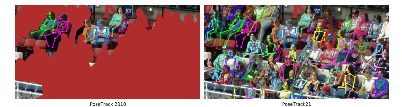
Figure 1. Comparison between PoseTrack 2018 [1] and PoseTrack21. We densely annotated crowded scenes to increase the difficulty for multi-person pose tracking, multi-object tracking and person search. Ignore regions are drawn in red color. Best viewed in color with a PDF reader.

tations of joint occlusions, accurate bounding box annotations even for small persons, and person-ids within and across video sequences. The dataset can thus be used for evaluating approaches for multi-person pose tracking, multi-object tracking, and person search. Furthermore, the dataset allows to compare methods for multi-person pose tracking and multi-object tracking, which has been so far not possible due to missing bounding box or human pose annotations. We thus propose a few baselines where we combine techniques for multi-person pose tracking, multiobject tracking, and person search and address the question whether extending approaches for multi-object tracking to multi-person pose tracking or vice versa is more promising. We finally provide a detailed analysis regarding strengths and limitations of existing approaches and baselines. The dataset and source code of baselines are available at https://github.com/andoer/PoseTrack21.