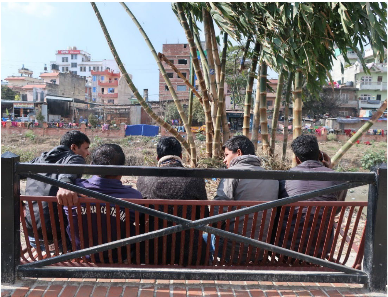
Image 1: Migrants waiting near the manpower bazaar for their local agent to take them to a recruitment agency