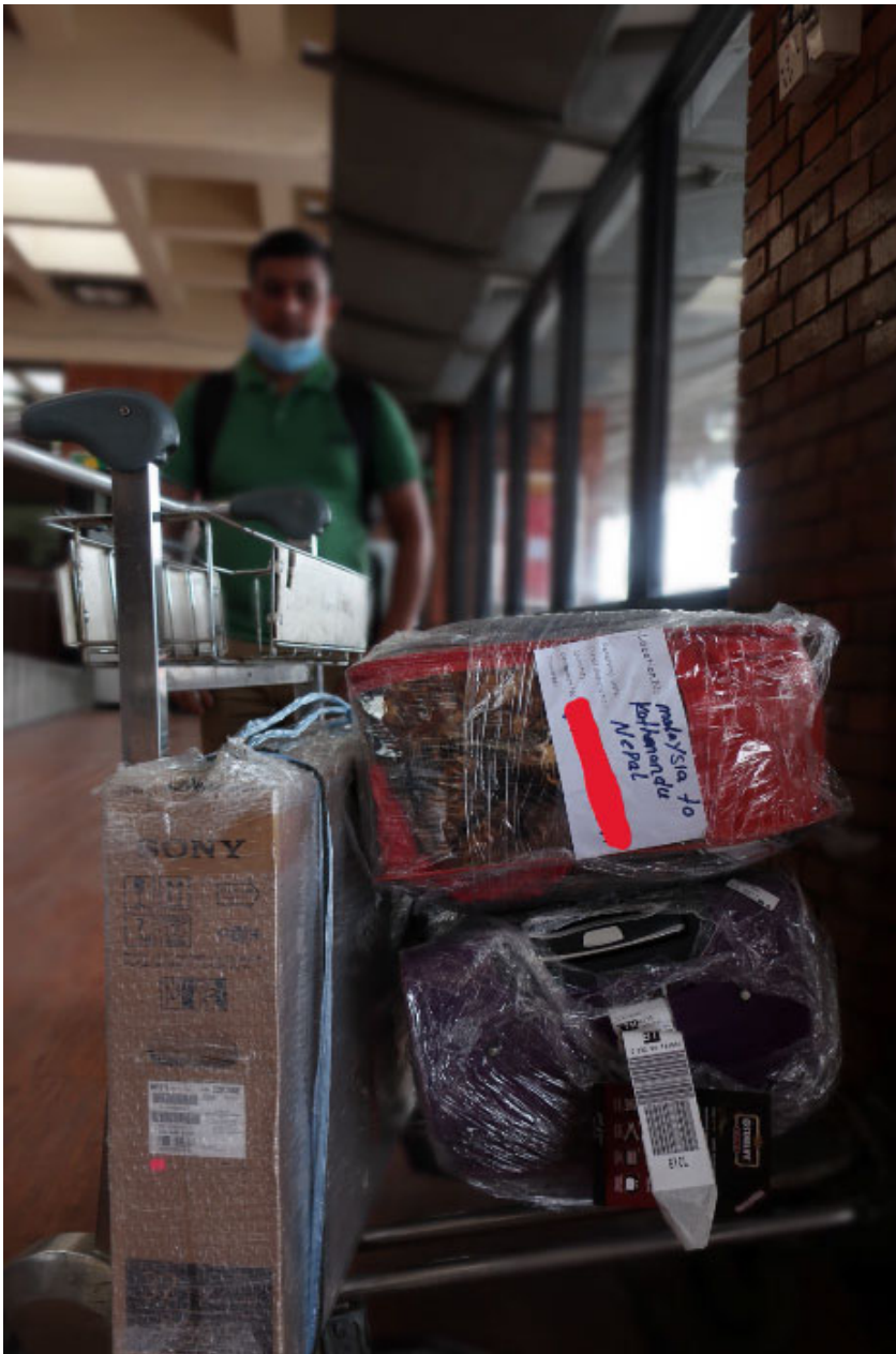
Image 4: A Nepali migrant returning from Malaysia with gifts for his family. The name of the migrant worker is obscured for anonymity