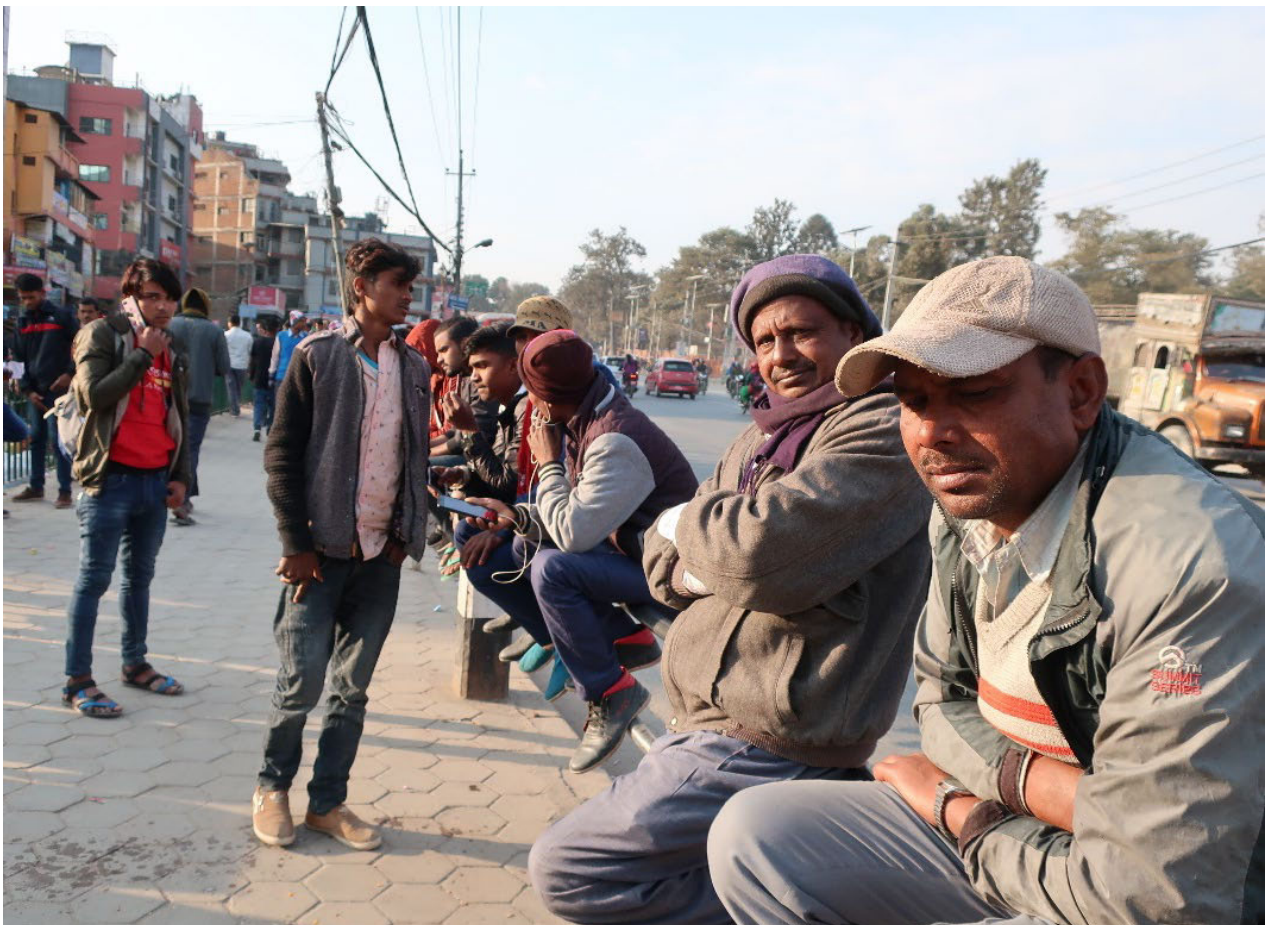
Image 2: Aspirant migrants in waiting, often spotted standing or squatting in the stretch between Guashala chowk and Pashupati plaza

Source: Photograph taken by the author, 09-12-2019, Kathmandu. CC BY-SA 4.0.