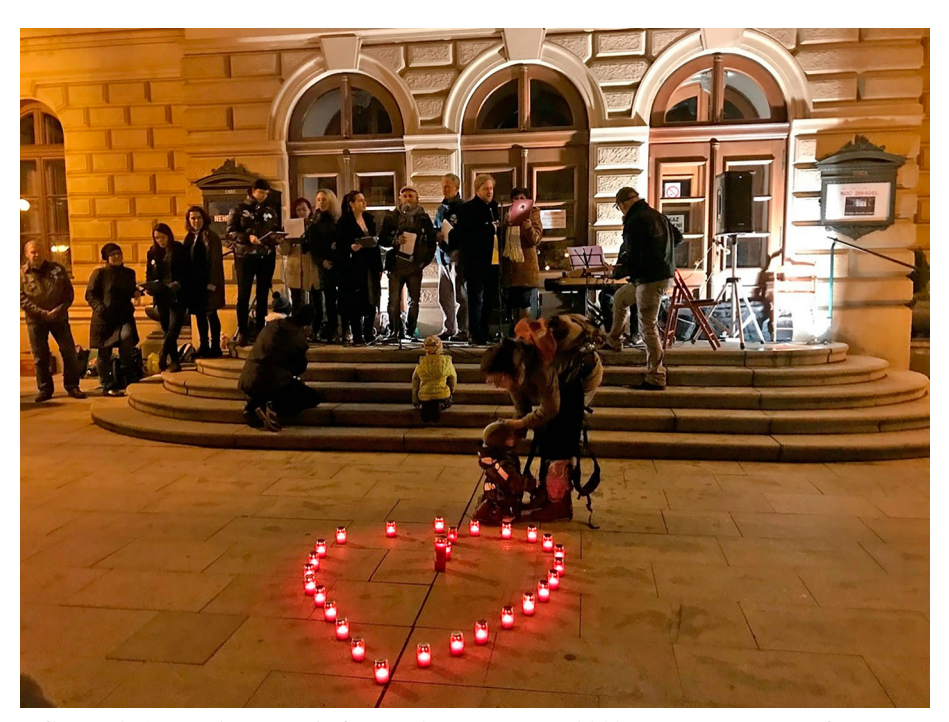
FIGURE 1. 'HAVEL'S HEART', OPAVA, 15 NOVEMBER 2019, DEMONSTRATION ORGANISED BY THE MILLION MOMENTS FOR DEMOCRACY OPAVA

Two days later, Opava's official celebration of the thirtieth anniversary of the Velvet Revolution, organised by the city council, commenced at 10am. Approximately 35 people gathered in front of the Memorial to the Victims of Totalitarian Regimes and Fallen