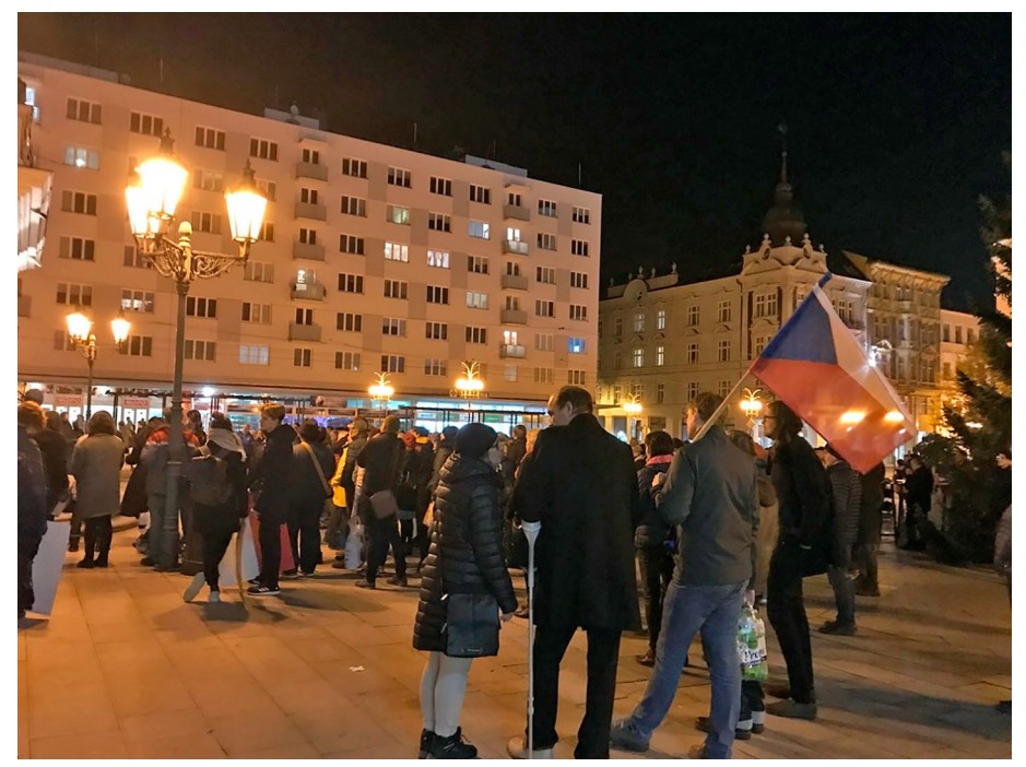
FIGURE 2. OPAVA'S UPPER SQUARE, OPAVA, 15 NOVEMBER 2019, DEMONSTRATION ORGANISED BY THE MILLION MOMENTS FOR DEMOCRACY OPAVA

Solders of World War I and World War II to pay tribute and lay flowers (see Figure 3). The majority of participants were middle-aged men in suits, many of whom I knew because of their work as local officials. Throughout the event, politicians, academics, public servants and local businessmen were shaking hands and talking casually. The ceremony evidently did not appeal to local people, who passed by without showing any interest. Two speeches were given. The first was delivered by Zbyňek Stanjura, an Opavian-born member of the Chamber of Deputies affiliated with the Civic Democratic Party (ODS), who spoke in very general terms about the heroism of the Czech people during both totalitarian regimes, namely, Nazism and communism.