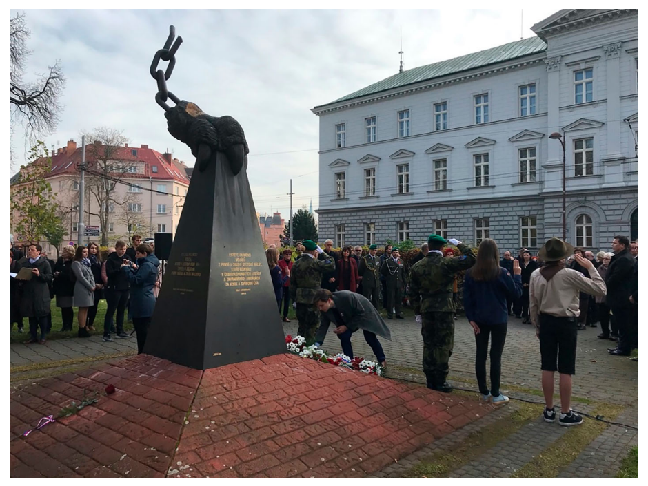
FIGURE 3. OFFICIAL COMMEMORATION OF THE THIRTIETH ANNIVERSARY, OPAVA, 17 NOVEMBER 2019, EVENT ORGANISED BY OPAVA'S MUNICIPALITY

despite having honest full-time jobs. The mayor was careful not to show contempt for those who genuinely believed in the ideals of communism and a just society, or for those who had been ordinary members of the Communist Party.