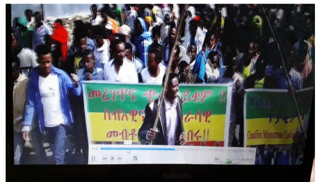
Figure 3. Youths organising demonstration (Taken from audio visual records of the movement kept by qeerroo/youths of the area September 2019).

and studied topics in the country of Ethiopia (Barata 2012; Braukämper 2018; Braukmann 2012; Freeman 2003; Hailu 2016; Mengesha 2014; Yoshida 2013). Common to all studies are occupational groups and clan-based marginalisation. The geographic focus is in the southwestern part of Ethiopia. The present study fills the existing gap in these previous studies and the starting point of this article lies in the following two points: First, we do not take the existing analytical categories of marginalisation-clan/individual experiences of social segregation and exclusion from engagement in the social life of their community. Second, we explicitly focus on ethnic groups living outside their “home” region. As such, one’s separation from home region has deeper implications for marginalised populations, who may experience more exclusion because of their ethnic background as compared to those ethnic groups living in their home region. This focus allows us to uncover the ethnic and regional nature of these groups’ marginalisation, rather than using clan,