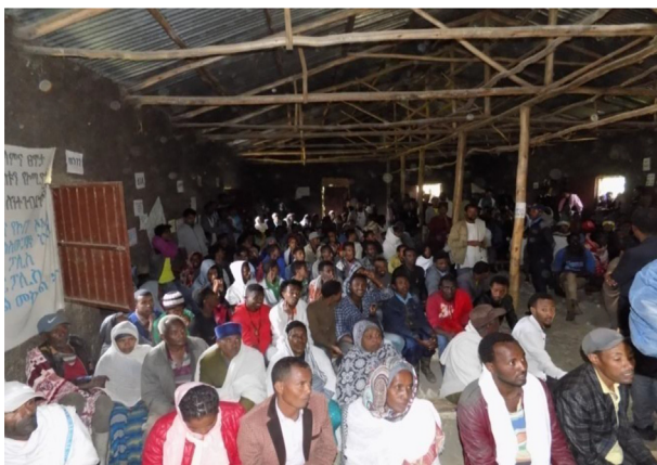
Figure 2. Hall meeting that Qeerroo representative committee held with community members.

and studied topics in the country of Ethiopia (Barata 2012; Braukämper 2018; Braukmann 2012; Freeman 2003; Hailu 2016; Mengesha 2014; Yoshida 2013). Common to all studies are occupational groups and clan-based marginalisation. The geographic focus is in the southwestern part of Ethiopia. The present study fills the existing gap in these previous studies and the starting point of this article lies in the following two points: First, we do not take the existing analytical categories of marginalisation-clan/individual experiences of social segregation and exclusion from engagement in the social life of their community. Second, we explicitly focus on ethnic groups living outside their “home” region. As such, one’s separation from home region has deeper implications for marginalised populations, who may experience more exclusion because of their ethnic background as compared to those ethnic groups living in their home region. This focus allows us to uncover the ethnic and regional nature of these groups’ marginalisation, rather than using clan,