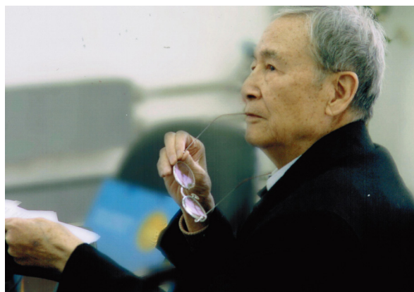
Figure 6: Ye Duzheng (2013), Institute of Atmospheric Physics, Chinese Academy of Sciences (中国科学院大气物理研究所). http://www.iap.cas.cn/qt/zthd/dnydz/yrxm/201310/t20131018_3958920.html .

Through the careers of Zhu Kezhen, Tu Changwang, and Ye Duzheng it is possible to see how the knowledge base of climate research expanded from historical records and geography to advanced mathematical models and theories in atmospheric physics during the twentieth century. The three pioneers were all exposed to international research through studying overseas, and they all strongly engaged with training climate scientists—in a sense, they were building a community of scholars that would be able to pass on the knowledge of climatic processes and changes to the Chinese people as well as the government.