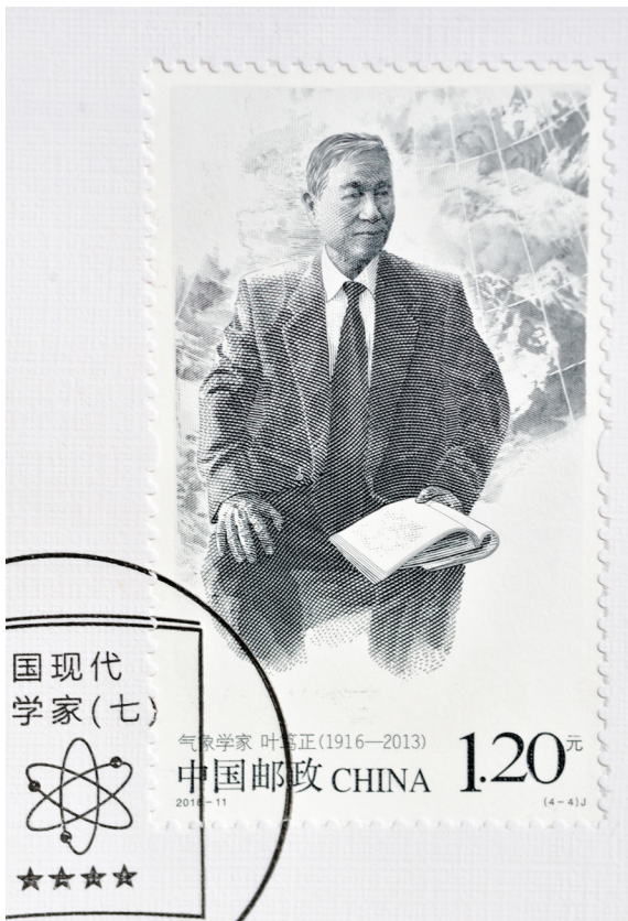
Figure 5: A stamp printed in China shows Ye Duzheng, Scientists of Modern China VII Stamp, circa 2016.

In his research, Ye Duzheng developed the scientific foundation for the establishment of Qinghai-Tibet Plateau meteorology, identifying powerful jet streams in the northern hemisphere that directly affected the weather and climate of East Asia. In addition, his theoretical work on atmospheric long-wave energy dispersion and the adaptive scale theory of atmospheric motion contributed to the understanding of East Asian atmospheric circulation and weather forecasting. 10