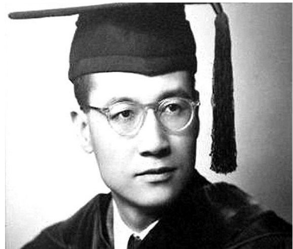
Figure 4: Ye Duzheng, photo, circa 1940 in Guangming Daily.

The next generation of Chinese climate scientists developed the global modelling system in the 1990s. They emphasized the importance of understanding the global climate system and became intensely engaged in the international awakening to the prospects of future climate change. The foremost intellectual leader of this new generation was the atmospheric physicist Ye Duzheng (1916–2013), who graduated from Tsinghua University in 1940 and, in 1945, left to do his postgraduate studies in the US. He returned to China in 1950 after earning a PhD in atmospheric physics under the supervision of a leading climate scholar Carl-Gustaf Rossby at the University of Chicago in 1948.