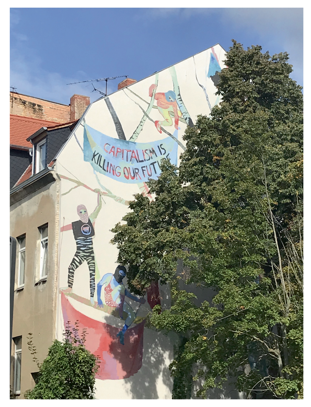
Figure 1: Mural in Halle, Germany, suggesting that capitalism is killing the future

by those unscrupulous multi-nationals is designed to enrich the future at the cost of those that inhabit the present.