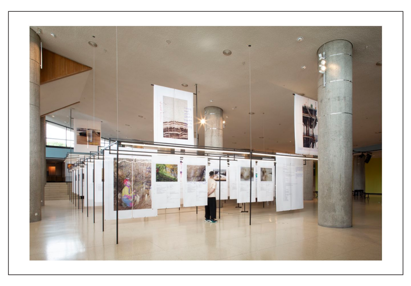
Figure 4. Installation view of Earth Indices at HKW from May to October 2022, a joint production by the artists Giulia Bruno and Armin Linke with HKW and scientists of the AWG. © Giulia Bruno and Armin Linke.