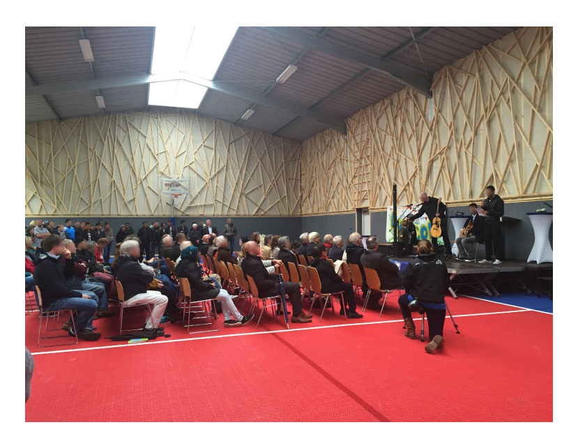
FIGURE 2 Opening of the new sport hall in Accommodation A.

Additionally, lectures, info nights and open discussions took place addressing different themes of refuge, migration and integration. With time and an increase in donations, the accommodation also had a gym room and a bike