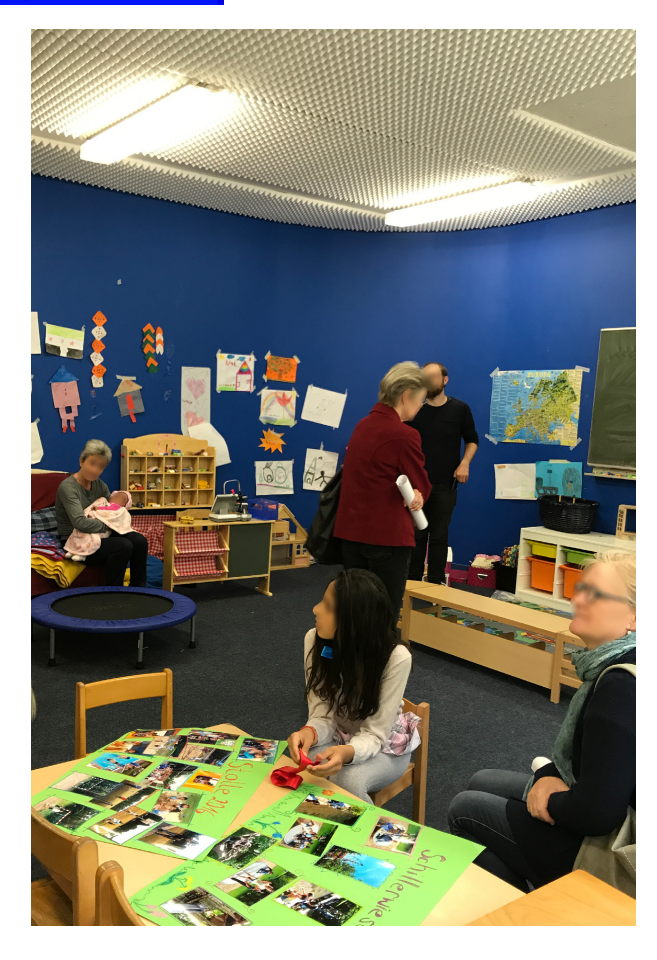
FIGURE 3 Exemplary communal room in Accommodation B.

repair shop to which forced migrants could register to borrow or fix a bike. Moreover, an impromptu local theatre project that included performers from among the local residents as well as forced migrants residing in different accommodation centres grew in the theatre space available on site. Akin to the sports activities of the Accommodation A , such bridging activities have had the effect of alleviating the socio-spatial exclusion as it on the one hand enabled appropriation of space by forced migrants and on the other normalized their presence for the local residents.