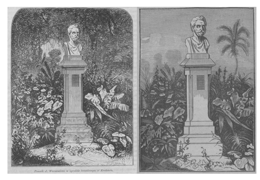
Figure 4. On the left—caption reads: "Statue of J. Warszewicz in the Cracow Botanical Garden," from Widman 1870, on 185; on the right—another image of the statue of Warszewicz in Cracow Botanical Garden, from Nowolecki 1870, on 45.

18 Ber. Wissenschaftsgesch. 46 (2023): 1 – 23