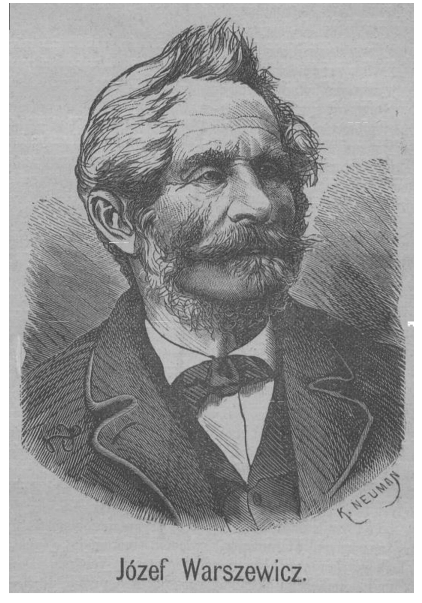
Figure 5. Warszewicz as depicted in Nowolecki 1870, on 41.

can be observed through a close study of the articles and the illustrations. Where articles were written by other parties the naturalists were often presented with hyperbole and pomp. The figures of the naturalists were used by the authors in the nation-building processes by being presented as admirable role