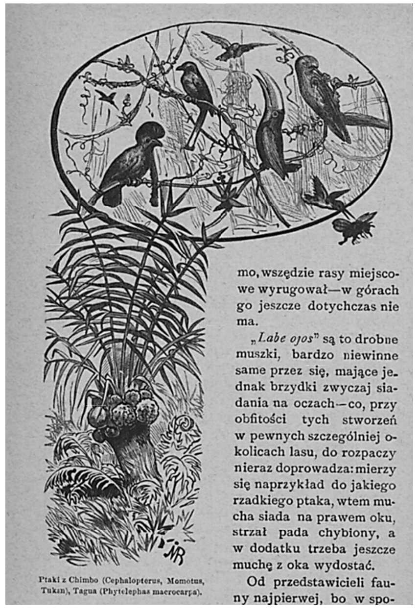
Figure 2. Caption reads "Birds from Chimbo (Cephalopterus, Momotus, Toucan), Tagua (Phyte-lephae macrocarpa)," from Siemiradzki 1885, on 116.

Chile in the nineteenth century, of natural history being transformative, rewarding and character building on personal level, can also be observed in the