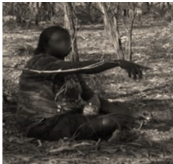
Figure 2a. Adult pointing gesture