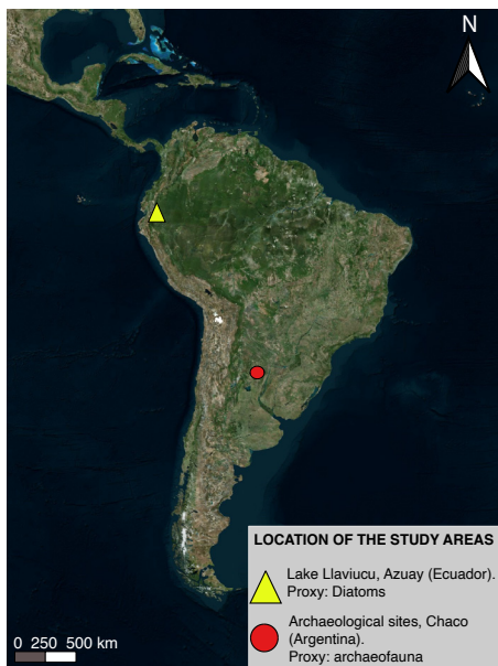
Figure 2: Geographical location of the two study cases presented in the main text. The yellow triangle indicates Lake Llaviucu. The red dot indicates the distribution area of the archaeological sites of the Argentina Gran Chaco.