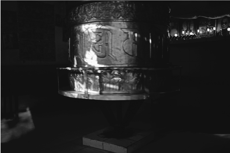
Figure 9.1. Prayer wheel spinning, symbolizing, among other things, the cyclic existence of death and rebirth.

heavy trunks symbolized two significant periods in his life in India. The smaller one was placed on a table in front of the shrine and had the words “base” written on its side in a military green color. This trunk was a material trace of his time in the Indian military, when as part of the Special Frontier Force (SFF), he was stationed at Indian military sites across northern India. The SFF was a military unit consisting of Tibetan men. It was formed in 1962 after the Sino-Indian War (1960–1962) and was a joint Indian-Tibetan operation (McGranahan 2010, 139), formerly known as Establishment 22.