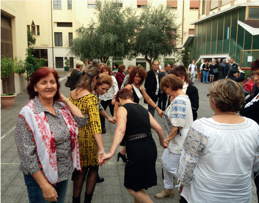
Figure 1.2. Women dancing at a Sunday Romanian event, summer 2017, Rome.

Single middle-aged people oftentimes attended events where traditional Romanian party music was played, and many danced for hours in pairs or in a horă (circle) (see figure 1.2). Another popular place to meet possible romantic partners among this age-group was church. While many younger people also attended services in one of the many Romanian churches in Rome, they were also more likely to have jobs that allowed for more socialization. For middle-aged people, many of whom worked more isolating jobs with strict schedules, Sunday mass was one of the few occasions to meet others with whom to have a coffee or a Romanian dish at a nearby canteen and exchange Facebook contacts with a romantic prospect. This observation echoes the findings of Ruxandra Oana Ciobanu and Tineke Fokkema (2016), who also concluded that among Romanian migrants in Switzerland, whether they migrated before 1989 or were new arrivals, going to church provided a sense of community and continuity, despite the fracture that migration had produced in their lives. For their aging interlocutors, practicing religion and attending services were preventing and reducing possible feeling of loneliness and isolation.