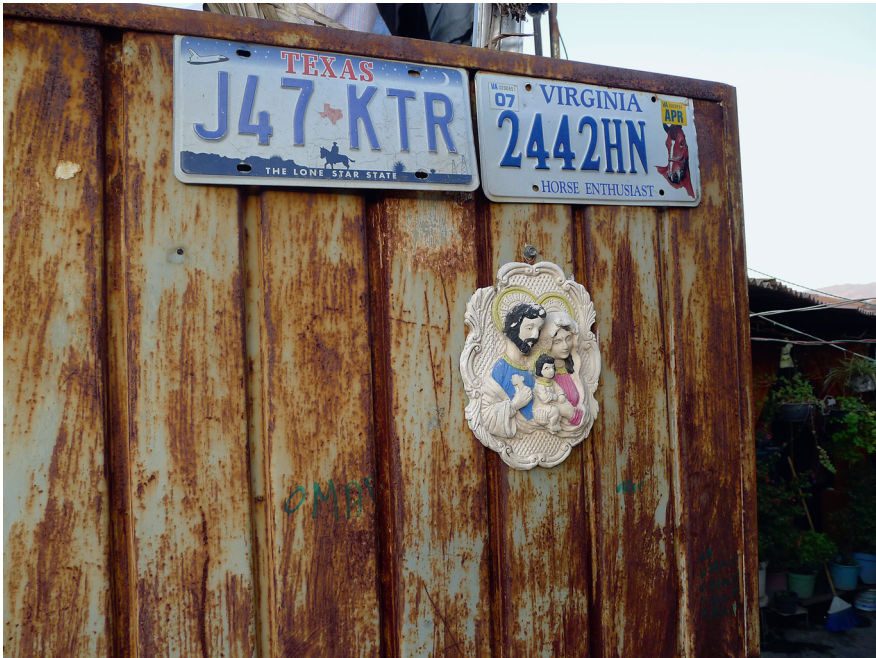
Figure 7.1. The entrance gate of a rural Mexican household, decorated with the license plates of absent family members working in the United States, 2013.

fact a more hidden layer of meaning, which requires research that pays more attention to the “inherent paradoxes and contradictions of remittance space” (171). An awareness of these troubling consequences of migrants’ aspirations might also be an explanation for the way in which the women valued the present when I asked them about their ideas of the good life.