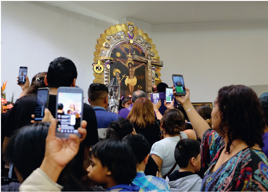
Figure 5.1. Here and there: Peruvian migrants live streaming the Lord of Miracles celebration in Santiago (Chile).