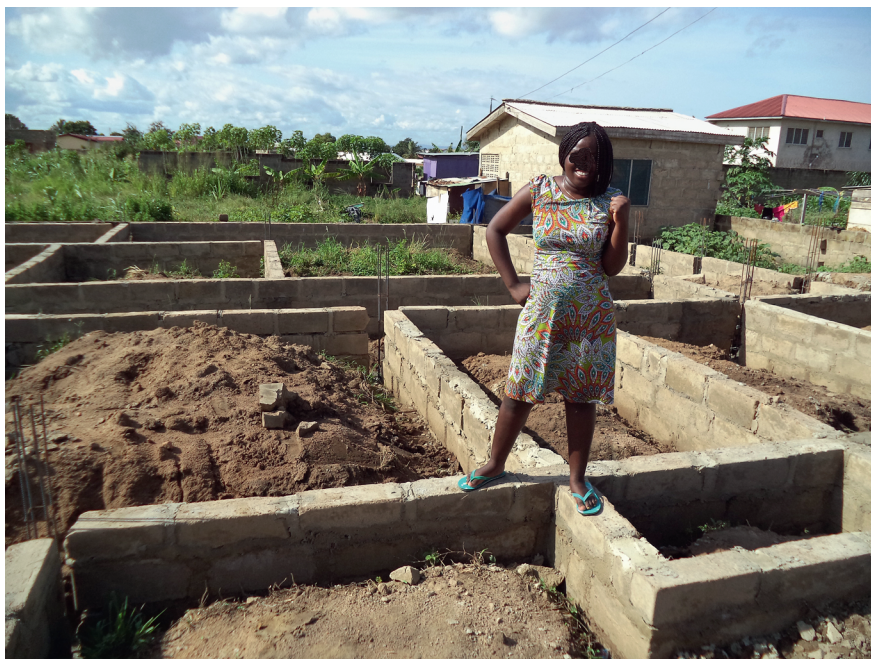
Figure 4.1. In Accra, Ghana, June 2015.