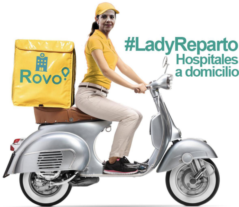
Figure 5: Lady Sidewalk repurposed as #LadyDistribution, “hospitals delivered to your home,” a commentary on corruption scandals. The face is that of the Minister of Interior. Anonymous meme.

extended from coronavirus contagion to the fear of a “social explosion”. The inability of the social order to maintain lives and livelihoods encouraged a punitive approach to the pandemic.