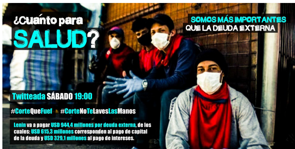
Figure 4: Image circulated on WhatsApp to promote a Twitter campaign to urge the constitutional court to suspend debt payments. The text at the top reads: How much for health? We are more important than the foreign debt.

own party—provides a striking example of the power of finance capital. The operation of this power, or how exactly the obligation to bondholders was imposed on the state, remains a question for further research. In the terms of the classic Miliband-Poulantzas debate, many of the government's critics preferred the "institutional" explanation of direct influence of capital on the state (see Fairfield, 2015)—which is also the most "scandalous" interpretation, insofar as it puts the onus on individual actors. Although the identities of the bondholders—and their relationship to the government—remain mostly unknown, Arauz and his circle suggested that members of the government may have direct financial interests in the debt (e.g., Arauz, 2020). Certainly, the Moreno administration has close relations with the financial sector, with bankers holding key positions in government, and there is substantial historical evidence of domestic financiers exerting direct influence on the Ecuadorian state (see e.g., Acosta, 2006). At the same time, this argument may underemphasize the breadth and diversity of forms of capitalist compulsion on the state, individualizing (and scandalizing) a systemically-produced outcome.