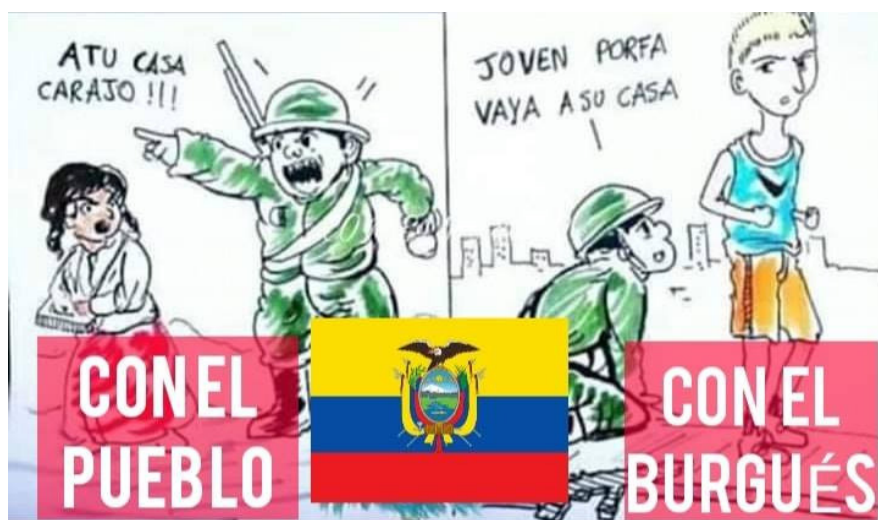
Figure 6: Contrasting enforcement of curfew for “the people” and “the bourgeoisie”. Anonymous meme.

employed by a hacienda near Quito, was indignant that the government would fail to pay doctors during a pandemic. But he also framed the challenge of COVID-19 in terms of Ecuadorians’ inability to follow guidelines: “if it was bad in Italy, Spain, the United States, places where people really do respect the rules ( hacen caso ), imagine here!”. My own observations indicated, on the contrary, that the guidelines and rules were widely respected in comparison to the United States. 21