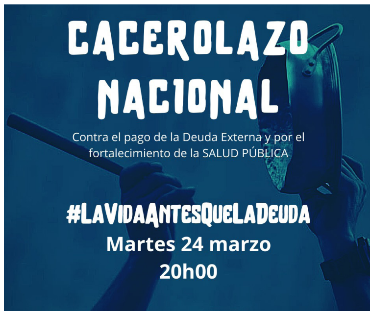
Figure 2: #LifeBeforeDebt. Call for National pot-banging demonstration against the payment of external debt and for strengthening public health on the 24 of March. Image circulated on WhatsApp.