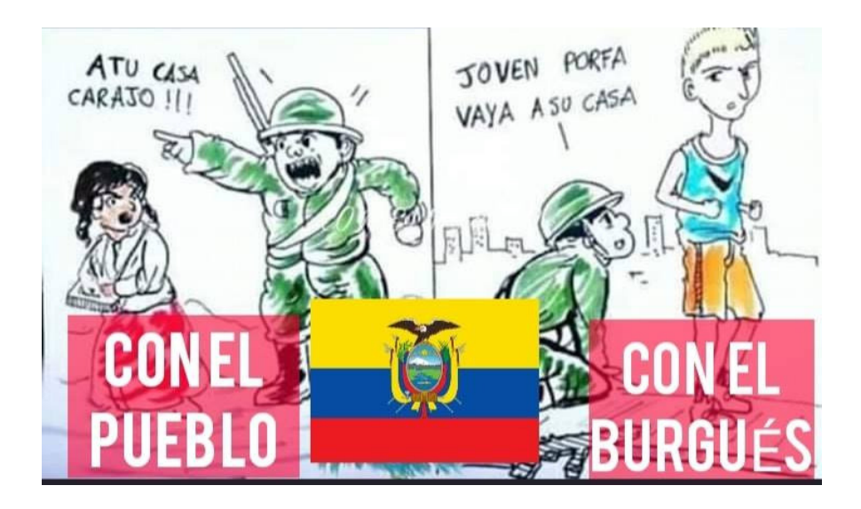
Figure 6: Contrasting enforcement of curfew for "the people" and "the bourgeoisie". Anonymous meme.

employed by a hacienda near Quito, was indignant that the government would fail to pay doctors during a pandemic. But he also framed the challenge of COVID-19 in terms of Ecuadorians' inability to follow guidelines: "if it was bad in Italy, Spain, the United States, places where people really do respect the rules (hacen caso), imagine here!". My own observations indicated, on the contrary, that the guidelines and rules were widely respected in comparison to the