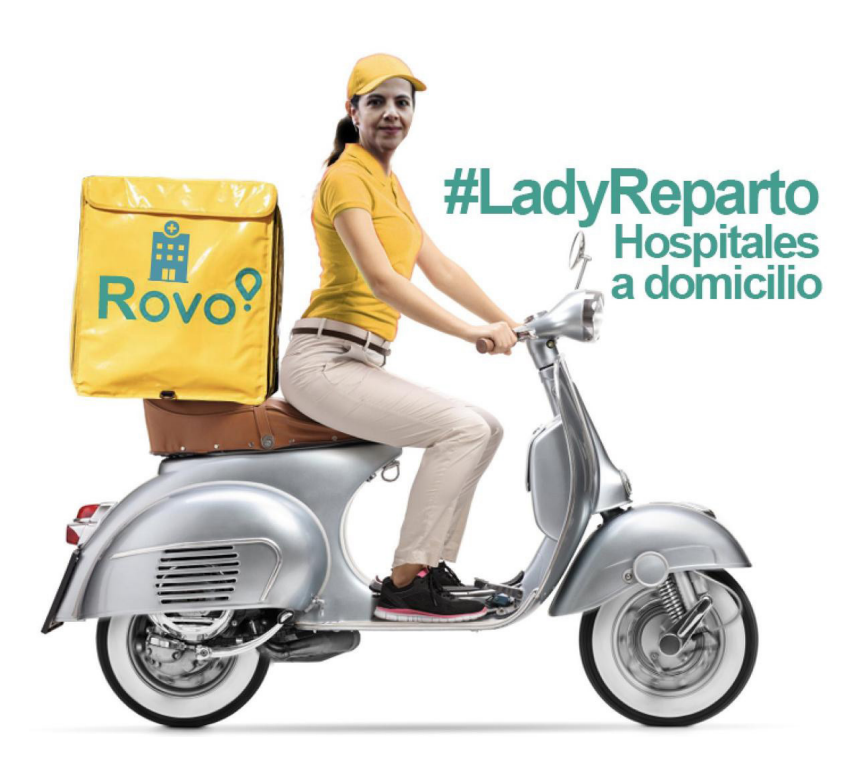
Figure 5: Lady Sidewalk repurposed as #LadyDistribution, "hospitals delivered to your home," a commentary on corruption scandals. The face is that of the Minister of Interior. Anonymous meme.

extended from coronavirus contagion to the fear of a "social explosion". The inability of the social order to maintain lives and livelihoods encouraged a punitive approach to the pandemic.