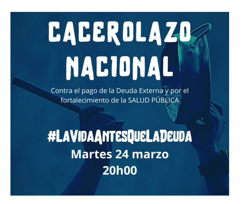
Figure 2: #LifeBeforeDebt. Call for National pot-banging demonstration against the payment of external debt and for strengthening public health on the 24 of March. Image circulated on WhatsApp.