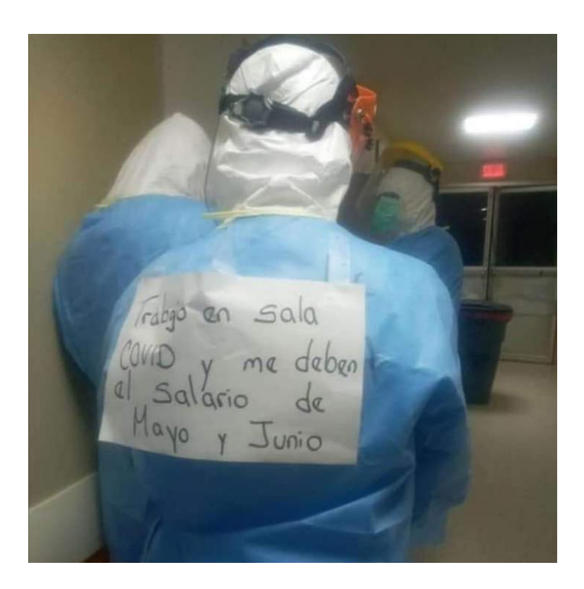
Figure 1: "I work in the COVID ward and they owe me my salary for May and June". Uncredited photo circulated on WhatsApp.

the way that the prospect of mass illness and death catalyzed the creation of new obligations (e.g., to remain at home or to wear masks) while also recasting existing ones (e.g., to pay wages, rents, and debts). In this article I consider how such obligations were renegotiated in Ecuador's public culture, including traditional and social media, during the crucial first six months of the pandemic, in order to shed light on how inequalities were reproduced and deepened at the cost of so many lives and livelihoods. I steer clear of drawing direct lines from public opinion to policy—in many cases (such as the payment to the bondholders), it is the breech between them that is most notable. I focus instead on providing a critical reading of the ideological and cultural matrix that shaped the course of the pandemic as a jointly epidemiological and social process.