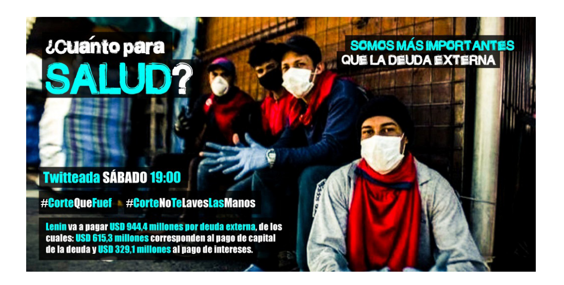
Figure 4: Image circulated on WhatsApp to promote a Twitter campaign to urge the constitutional court to suspend debt payments. The text at the top reads: How much for health? We are more important than the foreign debt.

own party—provides a striking example of the power of finance capital. The operation of this power, or how exactly the obligation to bondholders was imposed on the state, remains a question for further research. In the terms of the classic Miliband-Poulantzas debate, many of the government's critics preferred the "institutional" explanation of direct influence of capital on the state (see Fairfield, 2015)—which is also the most "scandalous" interpretation, insofar as it puts the onus on individual actors. Although the identities of the bond-holders—and their relationship to the government—remain mostly unknown, Arauz and his circle suggested that members of the government may have direct financial interests in the debt (e.g., Arauz, 2020). Certainly, the Moreno administration has close relations with the financial sector, with bankers holding key positions in government, and there is substantial historical evidence of domestic financiers exerting direct influence on the Ecuadorian state (see e.g., Acosta, 2006). At the same time, this argument may underemphasize the breadth and diversity of forms of capitalist compulsion on the state, individualizing (and scandalizing) a systemically-produced outcome.