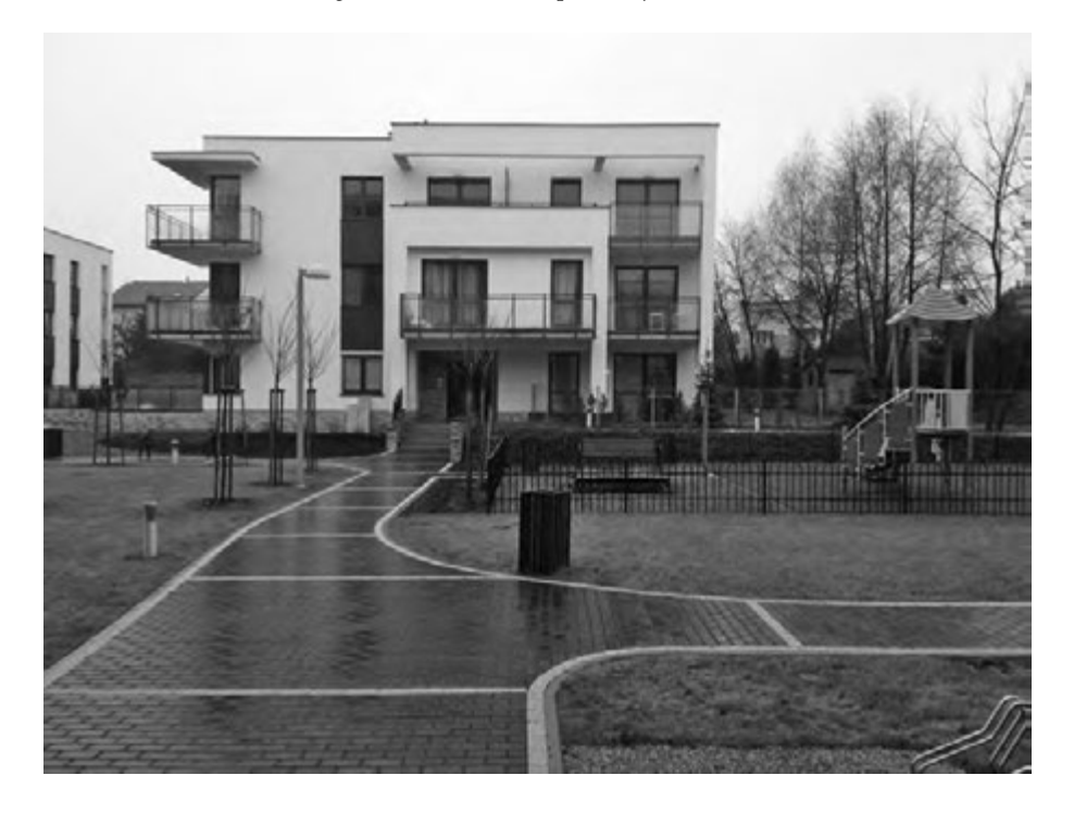
Photo 2 A neo-modernist new housing development in Warsaw, a popular horizon of aspirations among our interlocutors