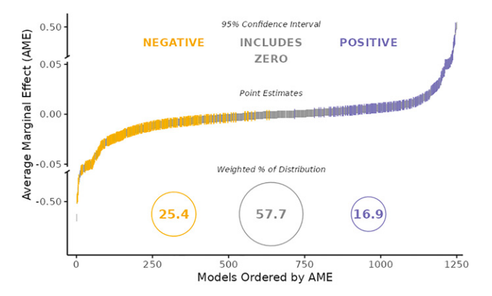
Fig. 1. Broad variation in the findings from 73 teams testing the same hypothesis with the same data. The distribution of estimated AMEs across all converged models (n = 1,253) includes results that are negative (yellow; in the direction predicted by the given hypothesis the teams were testing), not different from zero (gray), or positive (blue) using a 95% CI. AME are xy standardized. The y axis contains two scaling breaks at \pm 0.05 . Numbers inside circles represent the percentages of the distribution of each outcome inversely weighted by the number of models per team.

Next, based on PNAS peer review feedback, we generated a list of every possible interaction pair of all 107 variables. Of these 5,565 interactions, 2,637 have nonzero variance and thus, were usable in a regression without automatically being dropped. Including 8 or more interaction variables plus their main effects (i.e., 24 or more variables, many that were cross-level interactions) led to