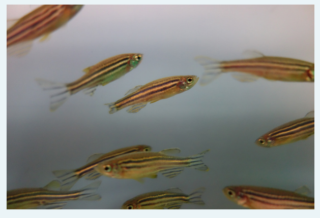
Box 3—figure 1. Adult zebrafish always travel in groups, whether in nature or in captive settings.