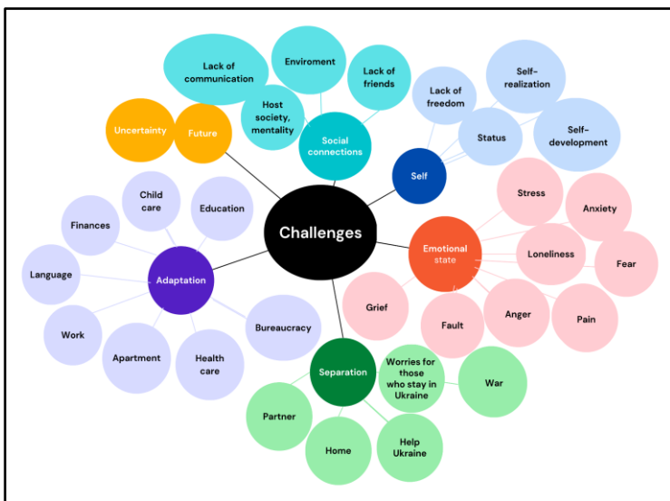
Figure 1. Main themes emerged from answers to open-ended questions