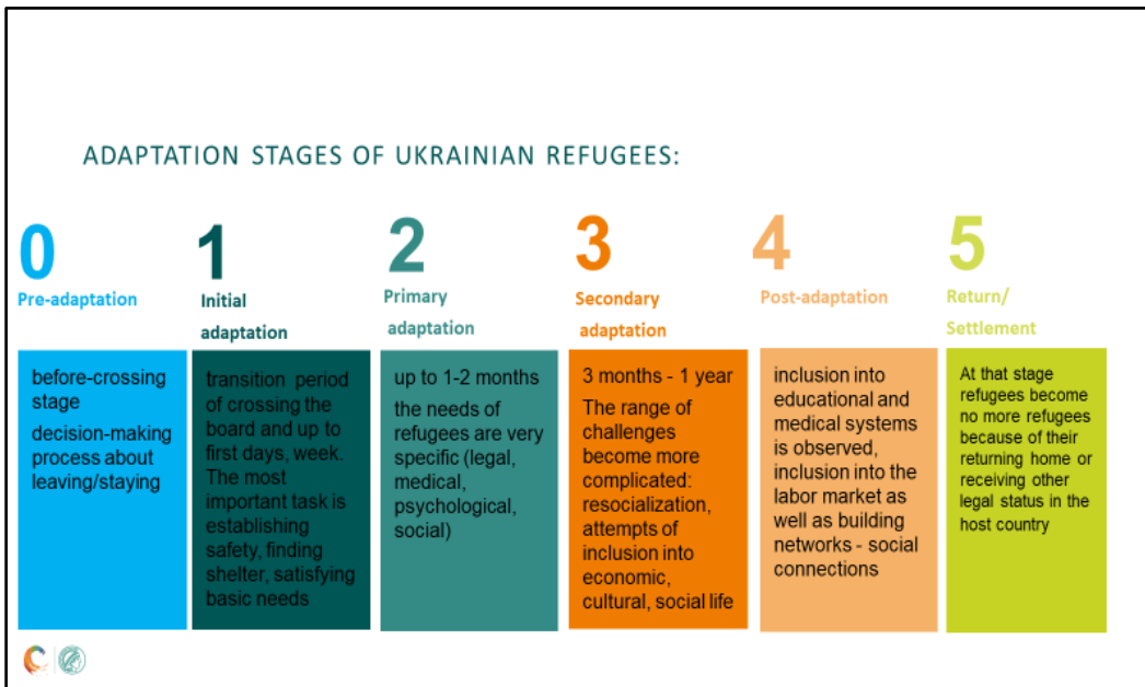
Figure 2. Model of adaptation stages and needs of Ukrainian refugees