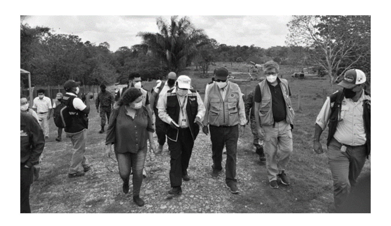
The IACtHR in a recent visit to El Darien, Panamá (2022)

The Inter-American human rights system, spearheaded by the Inter-American Court (IACtHR) and the Inter-American Commission (IACHR), has been the most outspoken advocate of <u>on-site visits</u> in its judicial practice. They have not only adopted regular sessions abroad but also visit individuals and communities in the process of <u>monitoring the compliance</u> with a decision by state authorities. Both human rights bodies employ those visits strategically as part of their <u>judicial communication</u> to increase their legitimacy. Pablo Saavedra, who became the Executive Secretary of the IACtHR in 2004, has developed the fundamental understanding of the Court as "una corte de toga y mochila" [a Court with robes and backpack]: