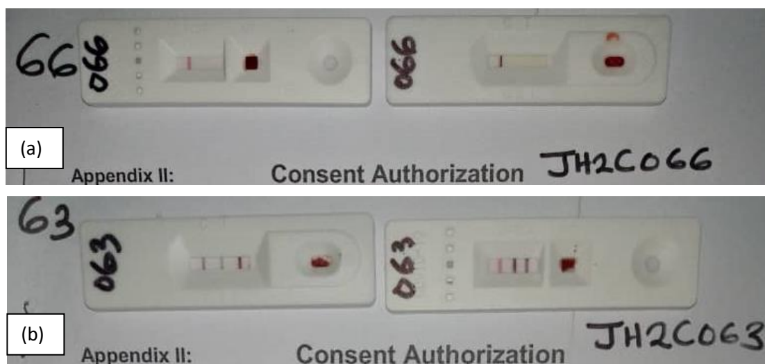
Figure 2: Pictures of test cassettes with results, on participants' consent forms. (a) Both cassettes show negative results for participant 66. (b) Both cassettes show IgM and IgG positive for participant 63. In (b), the FDA-EUA-Kit is pictured on the right.

Care was taken to place samples from each participant in both sets of test cassettes at the same time, with the results read from both after 10 or 15 minutes accordingly. Pictures of both cassettes placed on the consent forms of the participant were taken by the research assistants, as further evidence of test carried out, to eliminate any doubts over tabulated summary sheets as shown in Figure 2 for two participants.