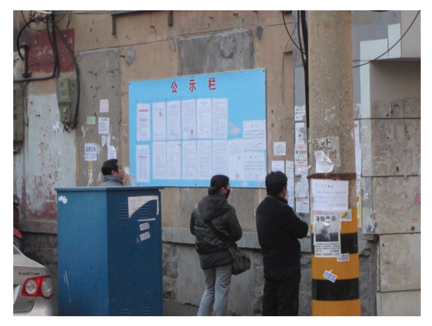
Fig. 6. Public notices informing residents of compensation and resettlement procedures (fieldwork photo, 2012)

eral times and pantomimed where officials would put it, namely in their own pockets. "They don't care about us common people," he concluded.