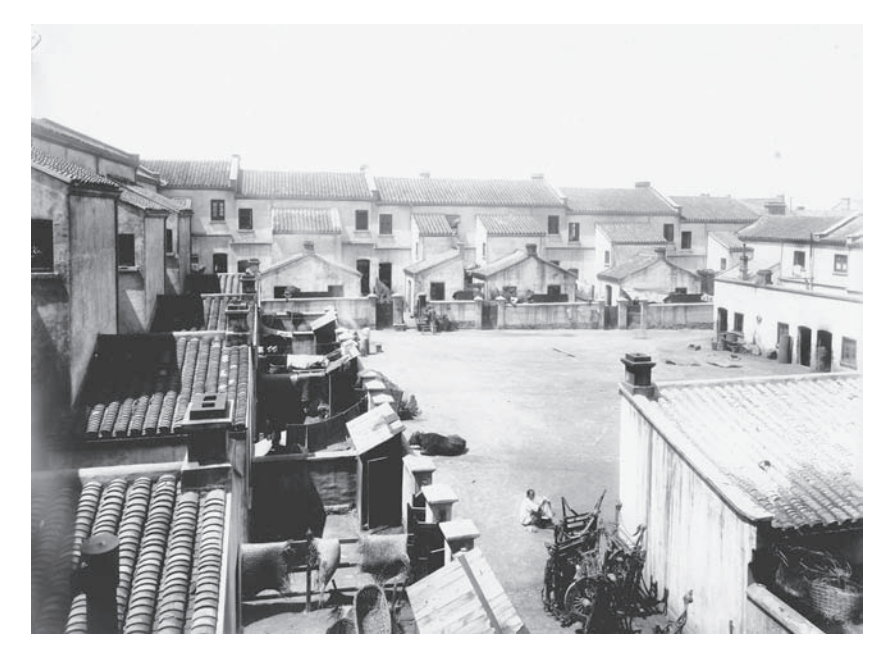
Fig. 1. One of the first courtyards built by Alfred Siemssen in Qingdao

blocked off from neighboring houses by a high wall, as well as including a simple ground-floor kitchen and an entrance to the large communal courtyard space. Because the Chinese soon began to copy this building style, I can say that I left my mark on Dabaodao.