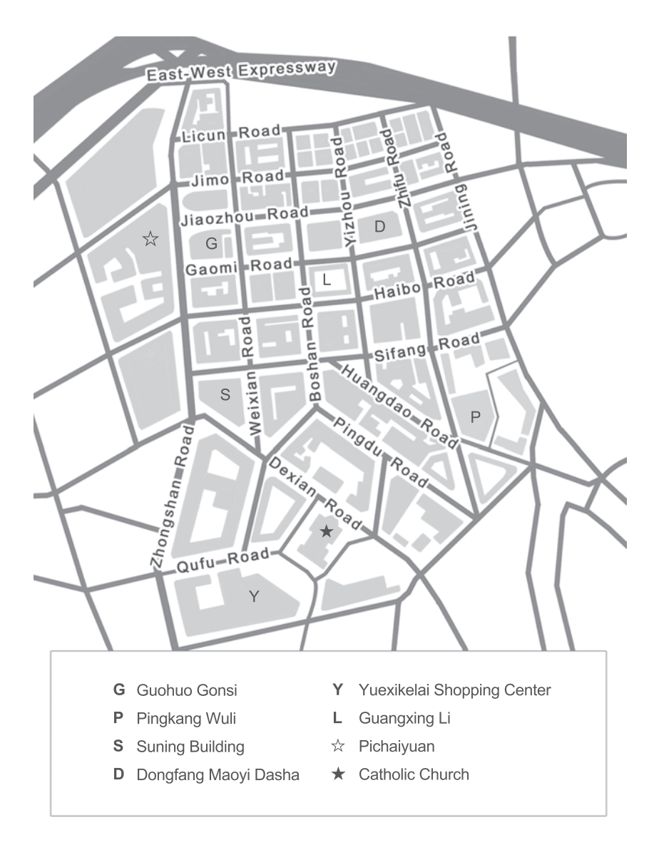
Map. 3. Map showing Dabaodao's grid plan. Dexian Road marks its southern end, Zhongshan Road the western border, Jining Road the eastern border, and the "east—west expressway" the northern border (© Qian Rongrong).