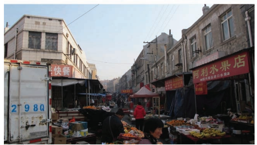
Fig. 8. The Huangdao Road market in 2011 (top left), in 2013 (top right), and in 2015 (bottom) (fieldwork photos)

wooden attic-like space without much headroom where Xiao Mei and Little Smile usually slept. On cold winter nights, we would sometimes have dinner there. Next to the ladder was a dark hole with a greasy gas stove, a small chopping board, and a shelf holding various seasonings and sauces. This was where Mr. Smile prepared food for sometimes up to 10 people. He had renovated the room when he first moved in and was running a pijiuwu.