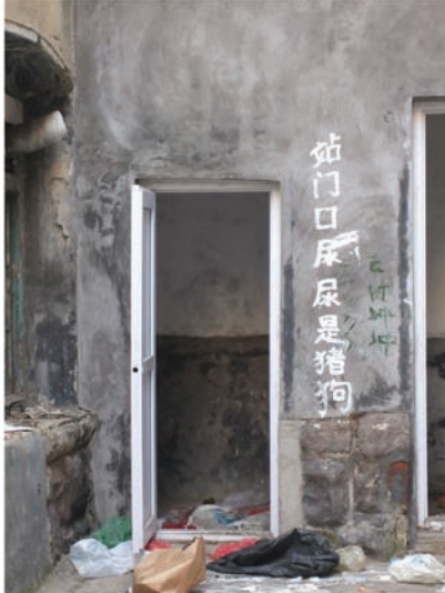
Fig. 5. Photos of toilet entrances in liyuan courtyards. On the left it reads, "If 'outsiders' want to use this toilet they have to pay." On the right it reads, "Whoever stands and pees in the entrance is a pig-dog" (fieldwork photos, 2013).

same time. Even after I closed the door to my room, physically isolating myself from the courtyard, I still took part in my neighbors' lives and they in mine. Both sound and smell constantly crossed spatial boundaries. In the mornings, I was rarely able to sleep later than six or seven o'clock, at which point the clamor of market vendors setting up their stalls outside served as an effective alarm clock. In the evenings, I always knew what my next-door neighbor was preparing for dinner. The cooking fumes, luckily rather pleasant, wafted into my room.6 Sometimes I would come home late at night when most people had already retreated into their rooms. When walking through the entranceway, into the courtyard, up the stairs, and along the corridor, I could clearly hear what each person or family was doing in their "private" rooms, whether watching TV, telling off their children, arguing, or snoring. My physical presence was likewise clearly known to people. Neighbors always knew which nights I spent in the liyuan and which I occasionally stayed in my university accommodation. One could hardly "escape" or enter the courtyard unnoticed. In this sense, privacy existed only nominally. The act of closing a door was a ritualized practice meant to shut oneself off from the outside world, but in actual