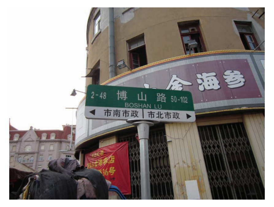
Fig. 4. Street sign indicating the administrative boundary between Shinan and Shibei districts (fieldwork photo, 2014)

the part of other individuals followed. Over the years, several coffee shops, youth hostels, and a few boutiques have been opened (and sometimes closed again) within Dabaodao.