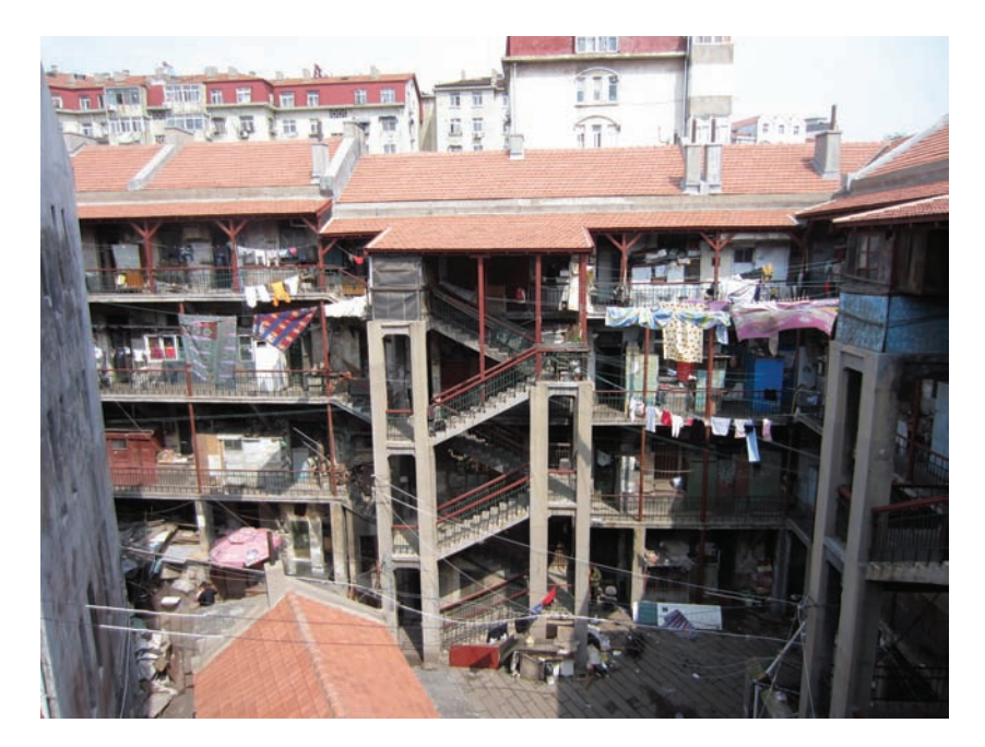
Fig. 3. Pingkang wuli (fieldwork photo, 2012)

best-known courtyards, partially due to its impressive appearance, with its four stories and imposing staircases (Figure 3), but also because it was one of Qingdao's "most flourishing brothels" before the Communist takeover in 1949 (Zang 2018, 26–27). Several elderly residents that I interviewed remembered the sex workers living next door, frequented especially by American soldiers in the period right after World War II, between 1945 and 1949. Pingkang wuli attracts regular visitors and has even been used as a backdrop for films. <sup>15</sup> The land parcel was initially purchased in 1912 by Gong Shiyun, who had his building company Gong He Xing construct a two-story liyuan house (Jin et al. 2012). Two years later, in 1914, a third story was added. In 1933, a Chinese entrepreneur named Chen Zhenshan bought the parcel, demolished the entire courtyard, and, following the same spatial layout as the previous one, built a new three- and partially four-story courtyard. Today's building thus represents multiple pasts and is illustrative of Dabaodao's multifaceted nature. Many liyuan followed a similar development path.