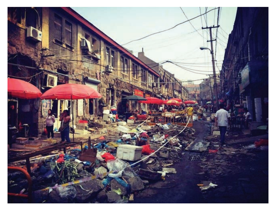
Fig. 9. The Huangdao Road market after the sudden cleanup (fieldwork photo, 2015)

do business. While in the everyday encounters between vendors and the chengguan , state power remained relatively elusive and of little efficacy, this in contrast was very much an overt and concrete demonstration of "despotic" state power (Mann 1984) and had an enduring impact. It furthermore underscored the very precarious existence of migrants living in the area. Though many were still quick to set up parasols and orange basins anew and continued, amid clearing work, to sell their goods, a notable shift had occurred. The local government persisted in shutting unlicensed shops down. "After that, it was never quite the same again," Mr. Smile recalled many years later.