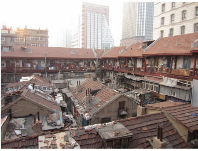
Fig. 7. Photos showing various types of self-built extensions to existent courtyards in Dabaodao (fieldwork photos, 2012–13)