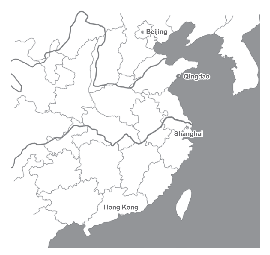
Map. 1. The location of Qingdao in China (© Qian Rongrong)

they have endured in a state of serious disrepair. When I began fieldwork in 2011, most of the courtyards were severely run down and lacked private kitchens, access to individual washroom facilities, or indoor tap water. Similar to old Beijing (Evans 2020), residents typically belonged to the urban underclass: unemployed and laid-off workers, the retired and disabled, landless suburban farmers, and struggling students. Beginning in the late 1990s, they were joined by a steadily increasing number of migrant workers, so-called waidiren (outsiders). Like other ethnographic monographs that focus on marginalized urban neighborhoods elsewhere in China (Evans 2020 in Beijing; Shao 2013; and J. Li 2015 in Shanghai), this book is thus also a study of urban poverty and precarity (Millar 2017).