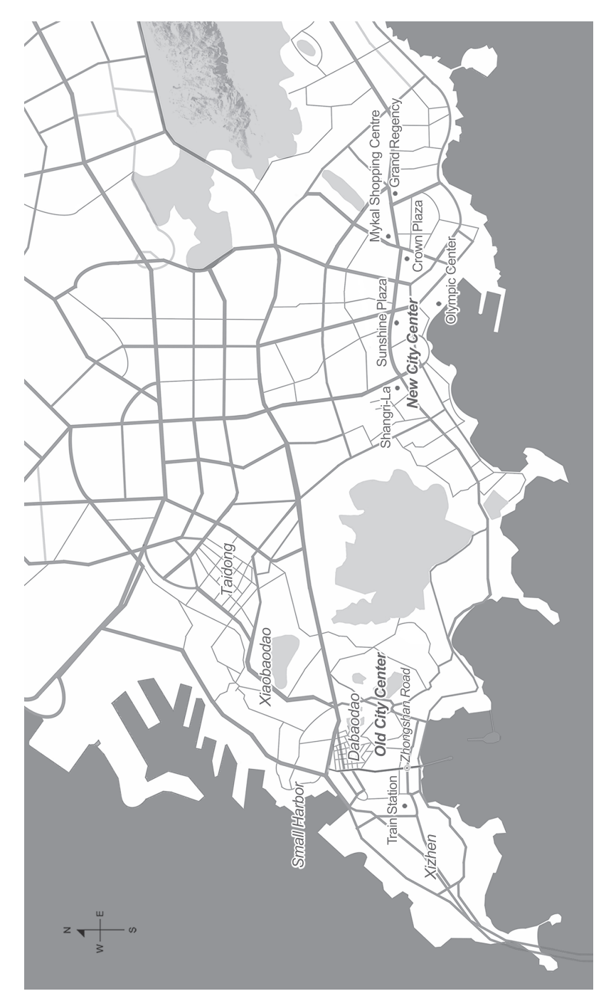
Map. 2. Qingdao's old and new city centers (© Qian Rongrong)