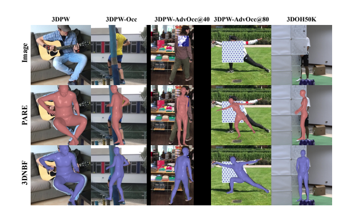
Figure 3: Qualitative results on evaluated datasets.