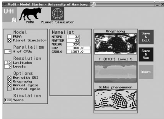
Figure 1: Screenshot of the Model Starter (MoSt).

mixed layer model with constant thickness and a thermodynamic sea ice model. Coupling to dynamical ocean models is under way and will be reported later.