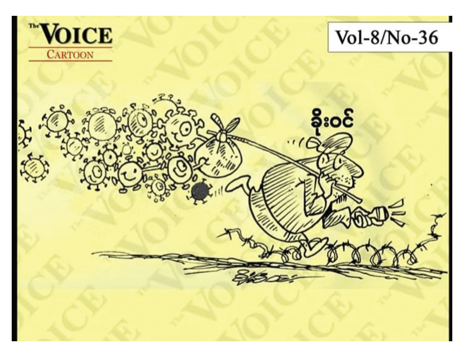
FIGURE 1 A Muslim or Rohingya man labelled as 'illegal migrant' crossing borders with viruses