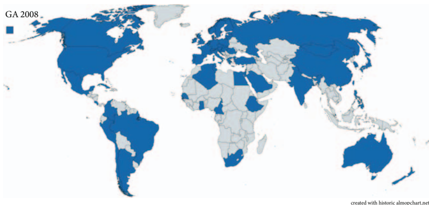
Figure 3.7 Map of IUPAP national members in 2008