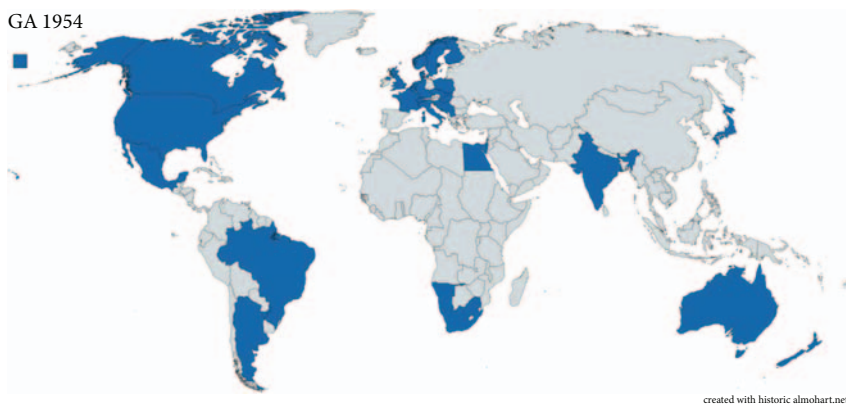
Figure 3.3 IUPAP national members in 1954