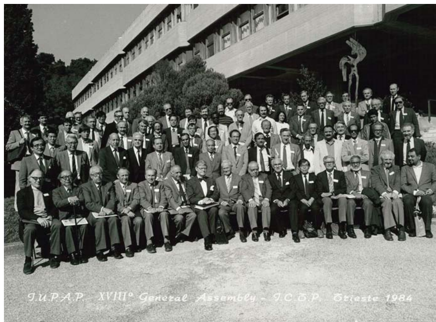
Figure 3.6 18th IUPAP General Assembly held at the International Center for Theoretical Physics, Trieste in 1984. It was the first General Assembly in which physicists from both PRC and Taiwan attended as official representatives