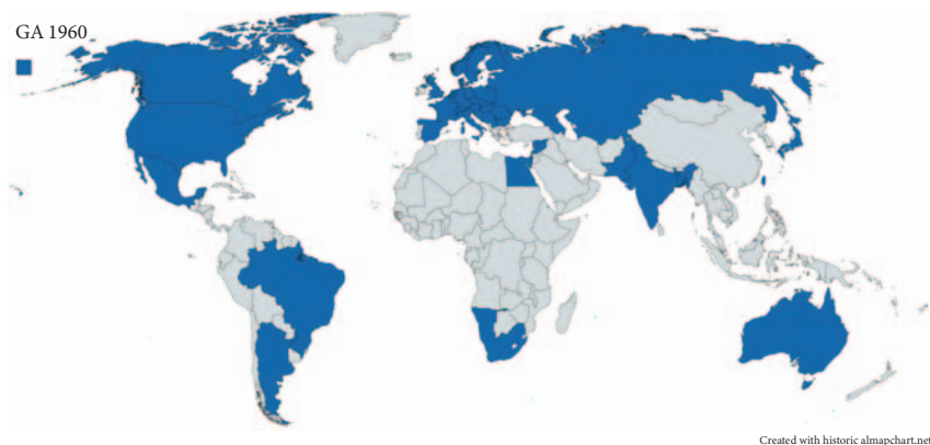
Figure 3.5 Map of IUPAP national members in 1960