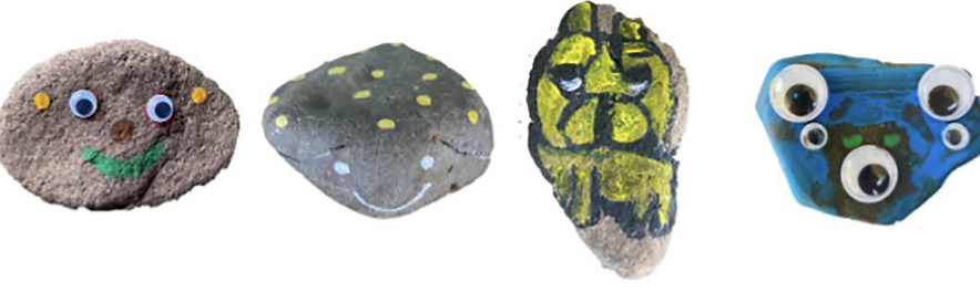
Fig. 2. Example rocks decorated by participants, organized by humanness ratings.