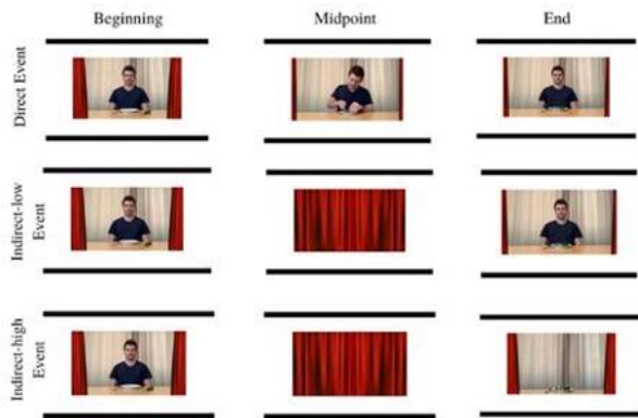
Figure 1. Snapshots of sample stimuli for Direct, Indirect-Low and Indirect-High Events.

Filler items consisted of 12 different videos of objects (e.g., pencils, cars) placed on a table in front of a plain wall. They were fully visible throughout the trial. The actor was not present in the videos. Participants were asked to identify the objects and answer a question about a property of the object (e.g., color, number, function). Filler trials were included to