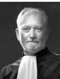
Anthony M. Collins Advocate General, Court of Justice of the European Union

(3) Lastly, mention ought to be made of two orders of the General Court of the European Union ruling inadmissible two cases that sought, respectively, the annulment of a decision of the European Chief Prosecutor to request lifting the parliamentary immunity of the applicant based on Art. 29(2) of the EPPO Regulation, 34 and of the Permanent Chamber of the EPPO on the ground that its decision issued in breach of Art. 10 of the EPPO Regulation, which governs the composition of the Permanent Chamber. 35