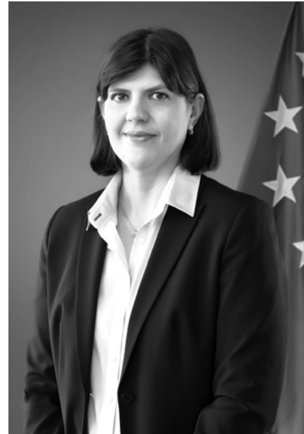
Laura Codruța Kövesi

Laura Codruța Kövesi , European Chief Prosecutor, European Public Prosecutor's Office