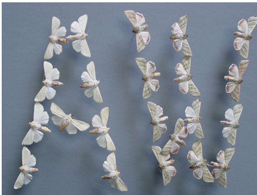
Fig. 1. Phenotypic differences between albino-type moths ('A', left group) and wild-type Heliothis virescens moths ('W', right group).

Experiment 1: Production of Offspring of Different Phenotypes. To assess paternity allocation, newly emerged albino-type female moths ( \leq 24 hours) were caged in 3.8-liter cartons (Neptune ® , Newark, NJ) capped with cloth (Batist